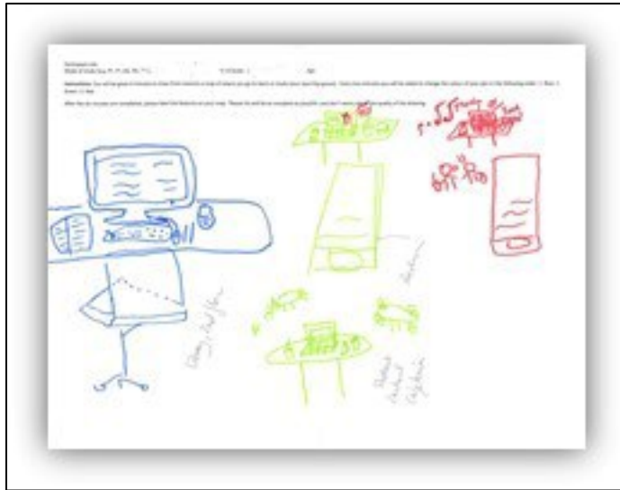
Figure 1 A cognitive map of the student's study spaces.