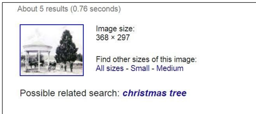
Figure 2 Screenshot of Google images result with multiple sizes.

Then each image was searched using the Google Chrome browser “Search by image” function. When available, the option to search Google for “all sizes” of the image, as opposed to just those