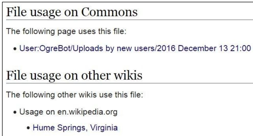
Figure 1 Screenshot of Wikimedia Commons file usage for “Hume Spring (c.1900) owned by Frank Hume (pictured far right).jpg” ( https://commons.wikimedia.org/wiki/File:Hume_Spring_(c.1900)_owned_by_Frank_Hume_(pictured_far_right).jpg ).