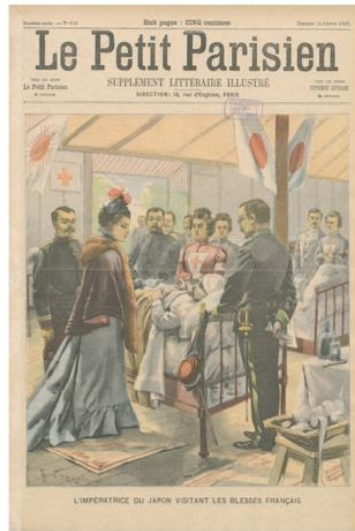
7. “L’impératrice du Japon visitant les blessés français”

n'y avait que du rire derrière ses larmes.” If a certain coherence is maintained in the structure of the text on a purely formal level (the supine state and tears of the statues reappearing in the child), it would seem that any dismantling of reified ideological symbolism enacted in the poem has itself been dismantled by its close. Is Jacob then