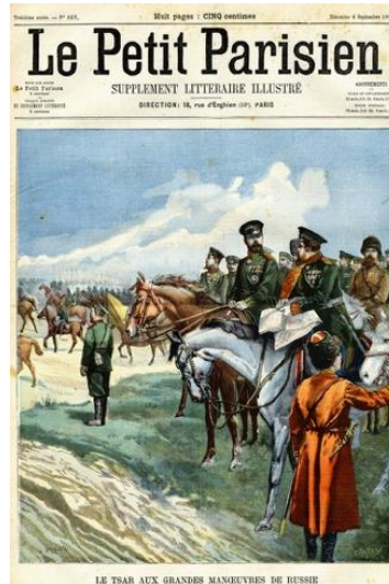
8. “Le Tsar aux grandes manœuvres de Russie”