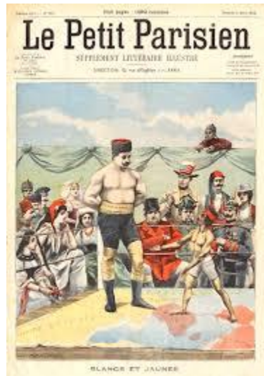
2. "Blancs et jaunes"