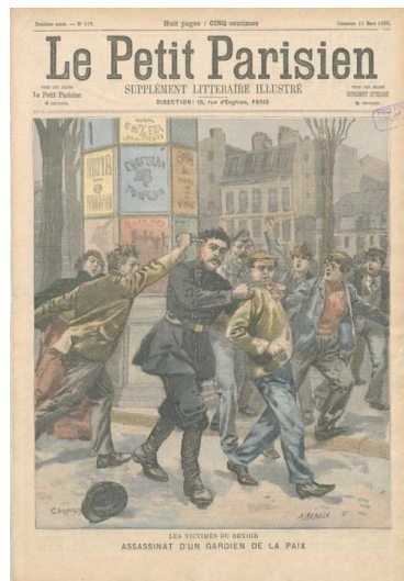
3. “Assassinat d’un gardien de la paix”

We find another example of this process in “Encore les indigents non ambulants,” where similar spheres intersect in unexpected ways. The opening presents a scene that could have been lifted from a feuilleton , welcoming the reader with its clear narrative and concrete referentiality—down to the “metallic colors” of the coins dropped into the woman’s alms cup: “Le perron de la mairie était plein de pauvres. Une dame secouait son aumônière devant les redingotes qui sortaient : « Donnez, messieurs, c’est pour les pauvres » et les mains laissaient tomber des pièces de toutes les couleurs métalliques” (94). A sudden event, also familiar to any reader of the Parisian dailies, with their lurid covers (see the scenes of street violence in images 3-6, below), then disrupts the ordinary flow of urban daily life, as the mother remarks her son passing with an inappropriate companion and lunges toward the woman, falling in the ensuing scuffle: “la dame charitable tomba sur les mains et l’aumônière fut renversée. Quel carnage ! les pauvres se ruent à la chasse de la monnaie.” This scene diverges significantly from those depicted in the papers, not in the event itself, and the images produced in the reader’s imagination, but in the reasoning behind them; a logic that arises from the merging of entirely different