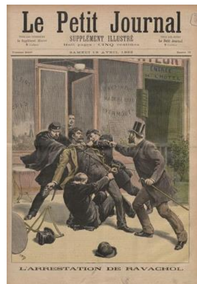
6. "L'Arrestation de Ravachol"

The question nonetheless remains: are such texts intended entirely as carefully crafted expressions of wit, that simply happen to be composed through the deconstruction of conventions exploited by journalism and the popular literature embedded within it, or is Jacob pushing the reader to reflect further on these conventions; perhaps, even, to actively engage with and change them, rendering our use of language less superficial?