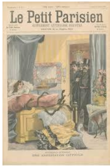
1. "Une arrestation difficile"

marin de Belle-Isle l'aura surprise pendant que, se croyant dans les solitudes, elle effaçait des rides avec quelque patte ou pâte." Such an effect is only positive for the reader, truly épaté by such a conclusion, to the degree that he or she is willing to accept the poet's invitation to play, beyond the expected conventions of discourse. Otherwise, abruptly transplanted into the texture of language, refused the sense of solidarity that journalism ultimately provides, as suggested by Schwartz, it is the reader who is left in a state of "solitude."