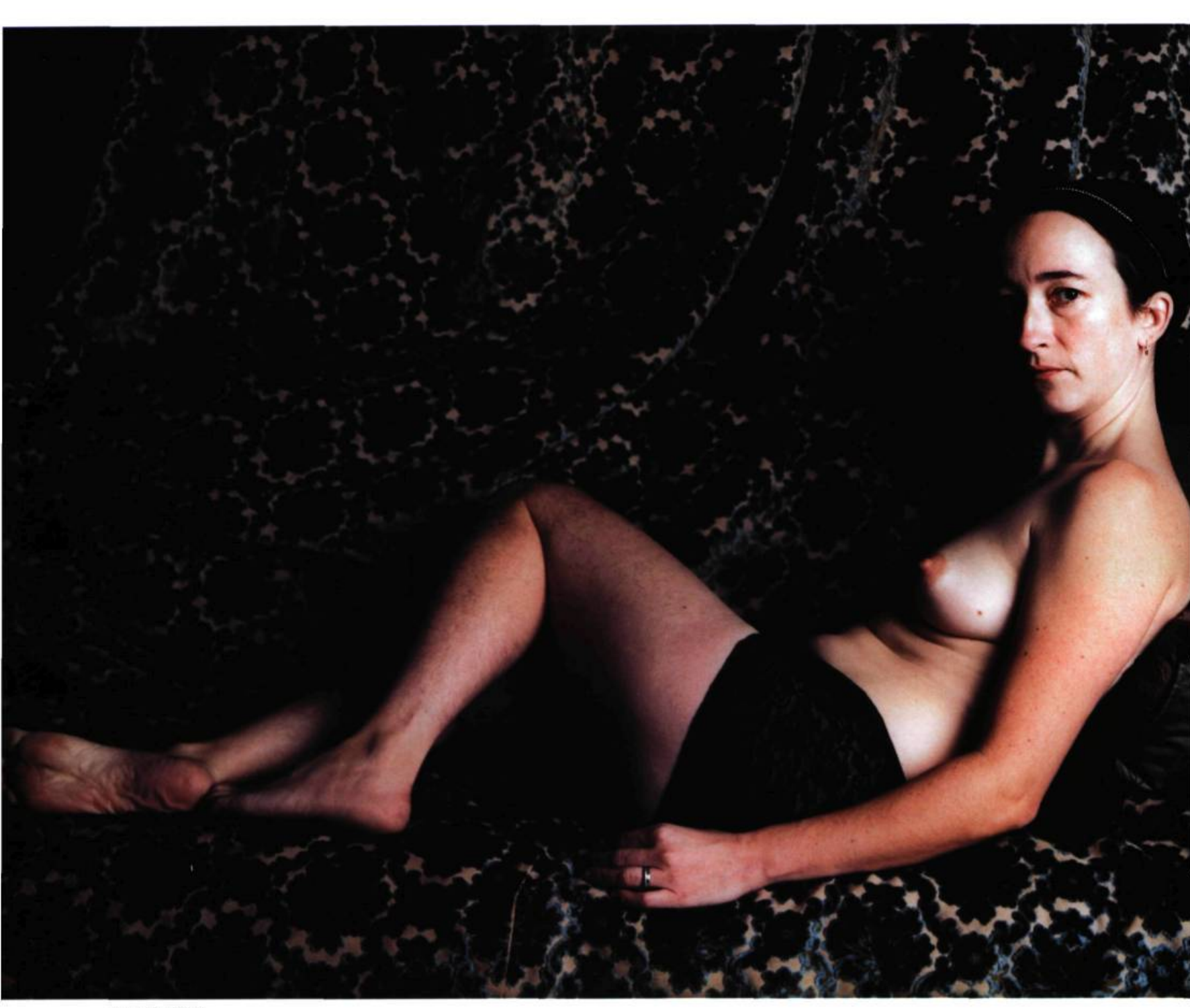
Marie-Christine 102 x 127 cm

from the series Belle de jour 22 color prints 2001