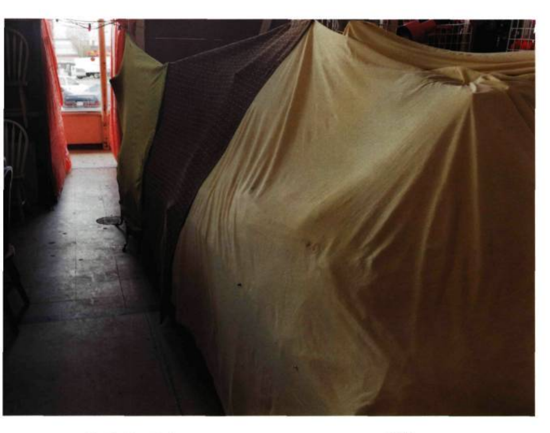
Untitled (corridor) The Market series Colour print 44 X 60 cm