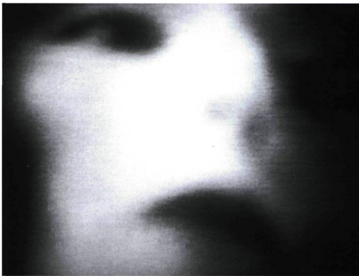
Ariane Thézé, Les lourdes portes de l'oubli, 1997, épreuve argentique, 79 cm x 79 cm.