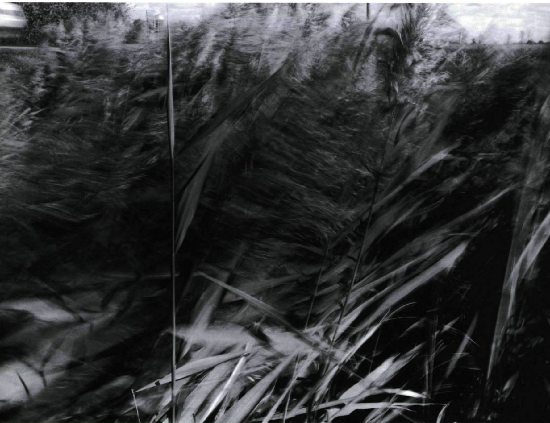
Sylvie Readman, Reflux ou les herbes fraîches , 1995, épreuve argentique, 124 cm x 166 cm.