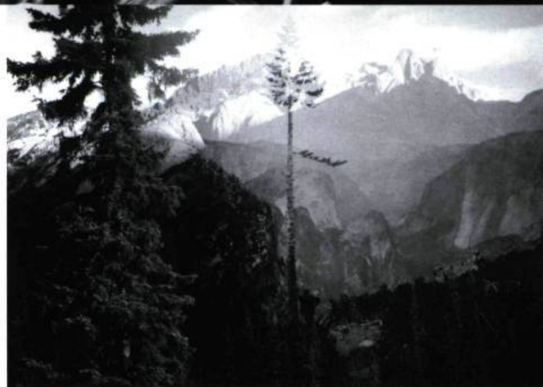
Petite histoire des ombres , 1er image d'une série de 8, 1991 épreuve argentique, 56 cm x 66 cm