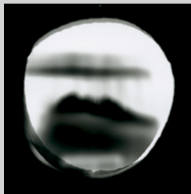
Mountain #1, 2015, silver print, 13 × 13 cm

An almost-life-size colour photograph, featuring the artist, questions the ethnographic narrative. The colonial subject of Laotian ancestry, represented by Bouabane's presence in the photo, stands proudly on a mountaintop with the Canadian Rookies in the background, approximating the modern-day selfie, with a coconut, mimicking a camera, mounted on a long wooden