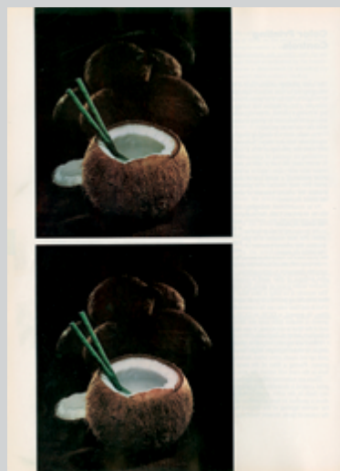
CC50G, 2016, colour print, 76 × 51 cm

Referencing the origins of photography, Bouabane uses a half coconut as a makeshift pinhole camera. His ostensible subject is the Canadian landscape, long mythologized by Canadian artists and synonymous with the creation of Canadian identity. But in Bouabane's analogue prints, the results are blurry and extremely expressionistic. Although engaging in their own way, the prints suggest the impossibility of ever finding a singular, coherent Canadian "voice" unmediated by discourse.