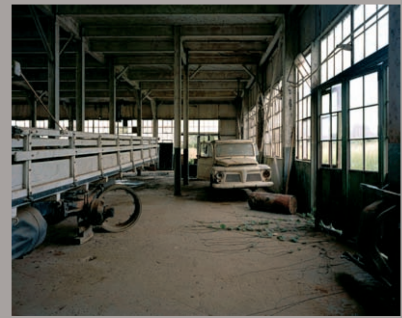
Untitled #27. Fordlândia. 2010-11. c-print. 76 x 95 cm

never estranged from the truth of what we are seeing, we witness the resonant artefacts that he offers up as first-level perceptual information. He invites us to stand on the threshold of these images alongside him, and to witness the evolving imprint of time and taste the ethics of memory. These views shine with integrity, speak reams about the "American way," and are unassailable in their formal verities, radiant in their truth-telling, and, above all, quietly ferocious in their critique.