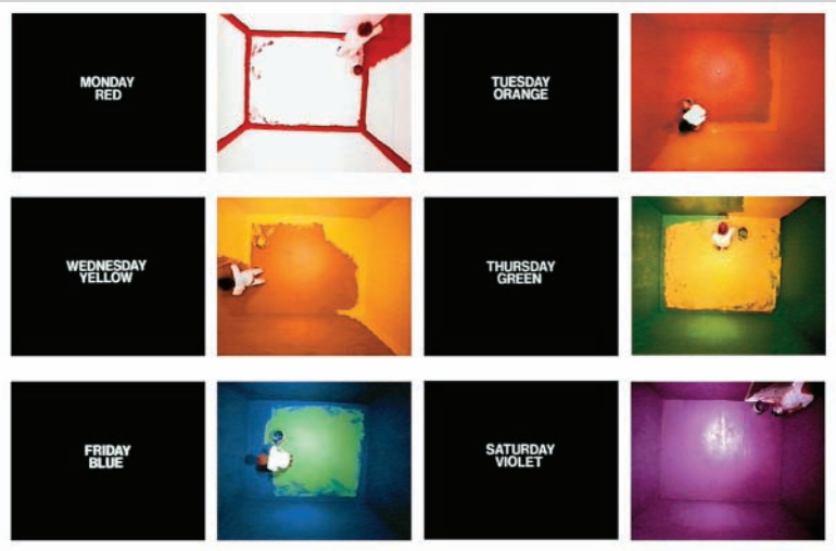
John Baldessari, Six Colorful Inside Jobs, 1977, video stills, 16 mm color film transferred to video, 32 min. and 53 sec., courtesy of the Marian Goodman Gallery, New York and Paris