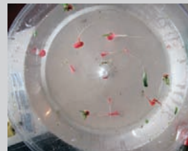
Raymonde April, Équivalences (detail), 2009, c-print, 76 x 102 cm

The distance between Personnages au Lac Bleu , her first installation, and the works shown at Galeries Donald Brown, Les Territoires, and Occurrence, is historically daunting but decidedly redeemed by her devotion and integrity and the sheer cohesiveness of her creative vision. She has always remained true to her own maverick