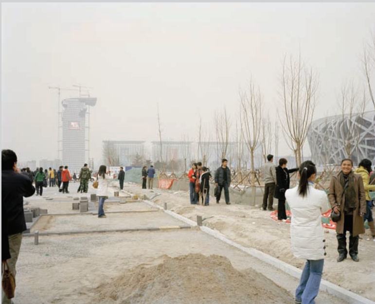
Raymonde April, Équivalences (detail), 2009, c-print, 99 x 123 cm

always evokes something numinous before and after those facts, however quotidian and unprepossessing they seem to be. She tackles a latent semiotic plenum that informs the fabric of a commonly experienced world, whether in family, inhabited spaces, or quirky souvenirs of the everyday.