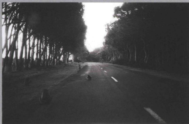
Wolfgang Tillmans, Tiere, 2005, C print, 144,8 x 213,4 cm

55th Carnegie International Pittsburgh, Pennsylvania, May 3, 2008–January 11, 2009