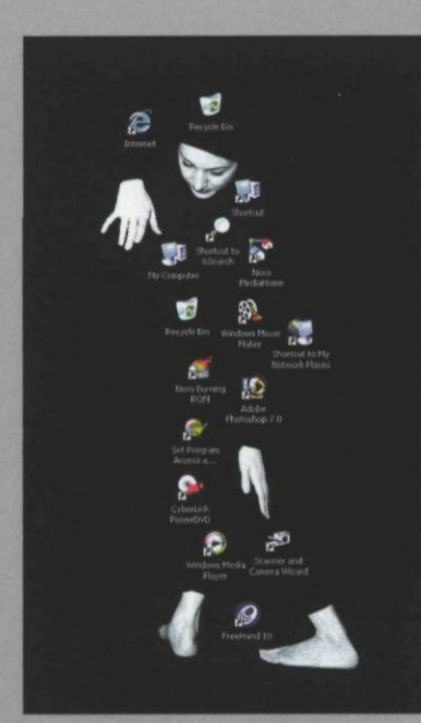
Shadi Ghadirian, ctrl+alt+delete, 2006, C-print, Courtesy of Cicero Galerie (Berlin).

"The headscarf worn in public by Iranian women should not be understood as a separation device," argued the German-based Iran scholar Katajun Amirpur during a panel discussion at Cicero Galerie, nor is the chador a symbol of oppression. This black dress, worn by the dancer in Shadi Ghadirian's eight digital photos ctrl+alt+delete (2006), is delightfully adorned with computer screen icons. The icons change in each photograph,