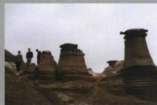
Jin-Me Yoon Rocky Mountain Bus Tour , 1991 From the Souvenirs of the Self series Chromogenic print 10 x 15 cm