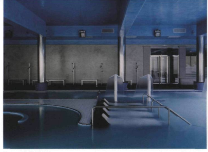
Lynne Cohen Spa, 2004 dye coupler print, 121 x 147 cm

If, in the 1980s, Cohen's emphasis changed, it was only for wider emphasis, and greater particularity. She pursued institutional