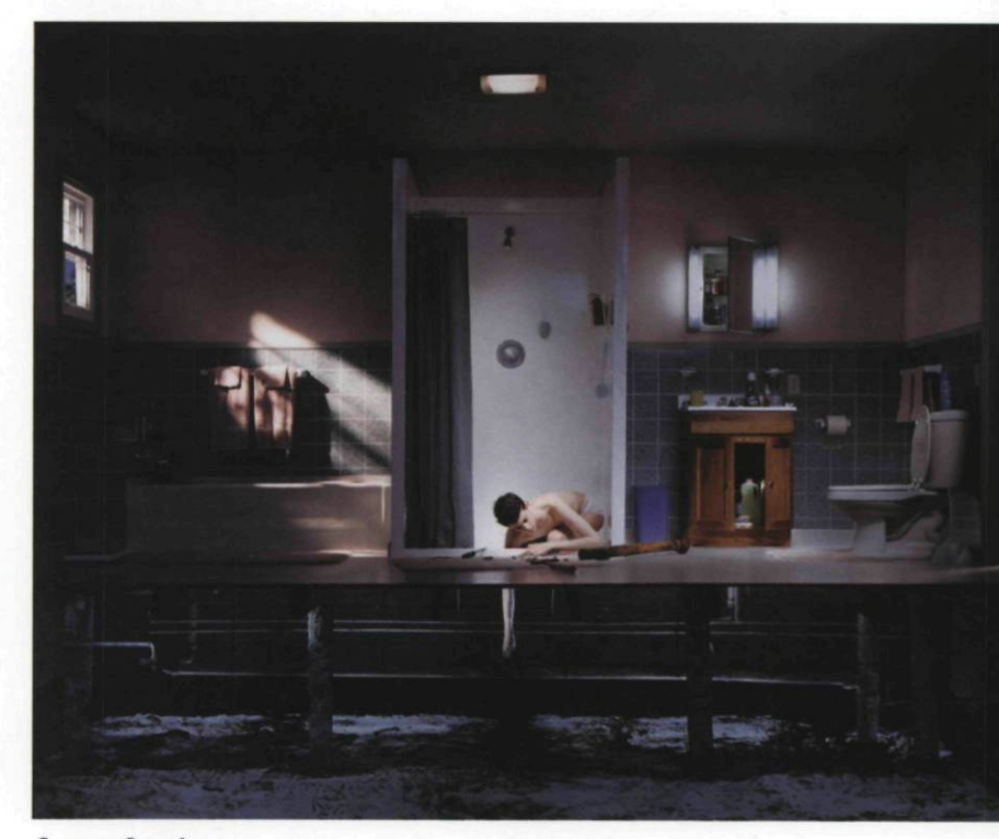
Gregory Crewdson Unitide dye coupler print 121.9 x 152.4 cm, 2001