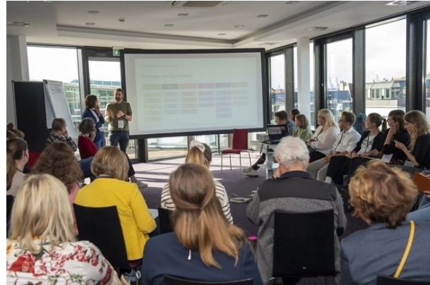
Figures 2 and 3. Workshop with educators at the network meeting of mobile maker spaces and at a STEM-educators meeting.

The learnings were taken into the final, third research phase, which we named “Identification.” Here, we introduced the essential findings and concepts developed in previous phases and opened up the findings for further, deeper discussion. An additional layer in this phase was that the educators and stakeholders involved were unfamiliar with the concept of critical making. Instead, they had a better understanding of TVET and education in general and could contribute to identifying challenges and opportunities for critical making in education. These will be contributing to a “Critical Making Manifesto,” which might be published as a poster and added to a box of tools to be shared with maker spaces and schools alike to inspire critical making in TVET and beyond. As this is still in development and not within the scope of the paper, we abstain from detailing the Manifesto here. We are only briefly mentioning it, as it was used as another way of engagement.