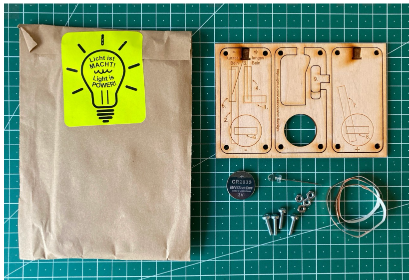
Figure 4. The torch kit, containing everything needed, in paper bags and sealed with a DIY sticker saying “Light is Power.”

For this purpose, we created a design for a small, functional torch. We focused on keeping it simple to demonstrate that also simple technical solutions can have a great impact and solve problems. The workshop was developed in an open source manner, with all materials and source files available online ( https://github.com/vektorious/cm-flashlight ). The documentation essentially allows for the hands-on, TVET part of the workshop to be reproduced anywhere, by anyone. In the following, we describe the technical and conceptual design of the workshop in detail.