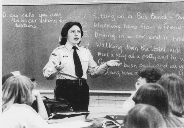
Figure 2. Full-page article on School Resource Officer, Edmonton Journal, April 4, 1981. (Material republished with the express permission of: Edmonton Journal/Calgary Herald, a division of Postmedia Network Inc.)