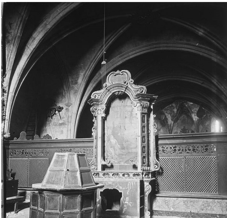
Fig. 1.2. The choir of the nunnery of la Mare de Déu dels Àngels in Barcelona, photographed in 1918. Barcelona, Biblioteca de Catalunya, Fons fotogràfic Salvany.