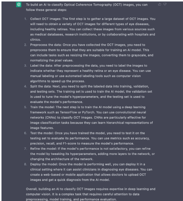
Figure 2. Generated from ChatGPT from the text prompt “how can I build an AI to classify OCTs.”

We then asked ChatGPT to code an AI to classify mammography scans (Figure 3).