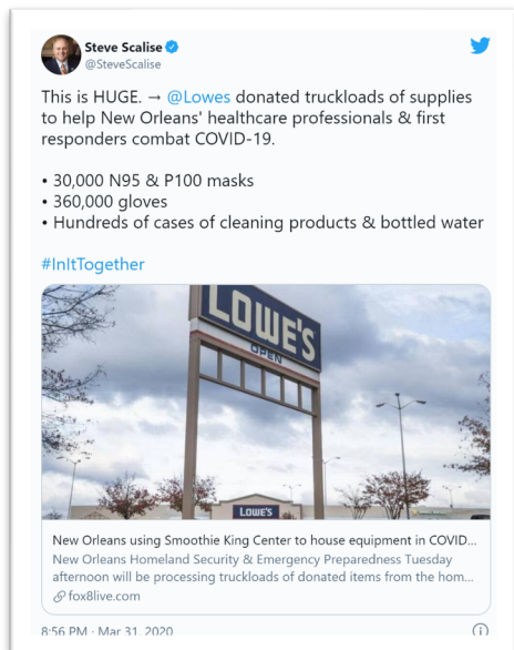
Figure 2 Lowe's announcing that large shipments of PPE are donated to the HCP. Large corporations such as Lowe's, Home Depot, and Target donated PPE to the hospitals and first responders. 31