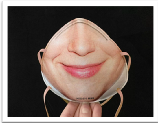
Figure 5. A San Francisco designer created “Resting Risk Face” masks by custom-printing the respirator masks with images of wearers’ faces. It has been advertised as “be protective and be recognized. It’s so easy.” 111

The face and by extension face coverings, have always been constructed with both denotative and connotative meanings related to social communication. 64,65 In North America for example, 66 masks were constructed as barriers to communication during the pandemic because they jeopardized people’s ability to judge facial expressions. 65,66 In contrast, the anonymity offered by face masks was presented as helping people to keep desired social distances in East Asian cultures, 67 where it is perceived as polite and modest not to show obvious emotions. 56,68 Face masks were used to send messages and carry messages throughout the pandemic. A dichotomy of being hidden versus being visible grew out of the face mask as stigma discourse. The common place use of masks in some parts of the world turned it quickly into a popular culture item. For example, Korean and Chinese celebrities often lead public fashion discussions on the face masks they wear. 69,70 Amidst the pandemic and with the broad adoption of masking around the world, face masks emerged as a new genre of fashion accessory, and an expression of personal style, and were sold by all clothing companies. 71 The U.S.-based online marketplace Etsy says its total sales doubled in April 2020, mostly from face mask sales. 72 Masks were also turned into an object for political communication as protestors printed messages on their masks to march in response to George Floyd’s death. 73