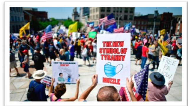
Figure 3.. A demonstrator holds a placard with a face mask stating, “THE NEW SYMBOL OF TYRANNY MUZZLE.” People had gathered outside the Pennsylvania Capitol Building to protest the continued closure of businesses due to the coronavirus pandemic on May 15, 2020 in Harrisburg, Pennsylvania. 110

The discourse of mask as a symbol of rights and freedoms was constructed in opposition to the idea perpetuated with the circulation of the discourse of mask as PPE. The later discourse was deployed in efforts to limit the virus' spread by appealing to the individual decisions of millions to comply with public health directives to wear masks in public. As bioethicist Nancy Kass, deputy director for public health of Johns Hopkins University's Berman Institute stated, “masks can be a form of virtue-signaling. By wearing a mask, people show their concern for keeping other people safe.” 42 Habitual mask wearing is constructed as a civic duty in the discourse of face mask, both to protect others and to take responsibility for oneself, especially seen in Eastern Asia cultures, such as China and Japan. An article by the South China Morning Post acknowledged that “wearing face masks is often seen as a collective responsibility to reduce disease transmission and can symbolise solidarity.” 43