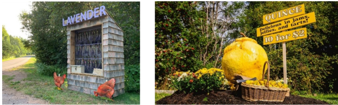
Figure 1: Alexis Bulman's Future Booths, located in rural PEI, feature lavender and quince, both crops that are adaptive to the high temperatures and drought expected on PEI as climate change progresses.

Also in 2021, CreativePEI and The River Clyde Pageant launched Riverworks , a project in which three artists independently created artworks on the topic of ecological transformation. As mentioned above, erosion is a key impact of climate change and a priority area in Epekwitk's climate adaptation plan (Government of Prince Edward Island, 2022). Several shoreline preservation techniques exist, and living shorelines are one such solution. Living shorelines provide a nature-based alternative to more common hard-armouring techniques, using natural materials to reinforce the shoreline without destroying habitats (Howard et al. 2022). Each Riverworks artwork (Figure 2 below) is (or was) located on a different living shoreline in Charlottetown or the neighbouring town of Stratford. Together, the shorelines and artworks present an opportunity for the public to engage with transformations in their communities brought about by climate change.