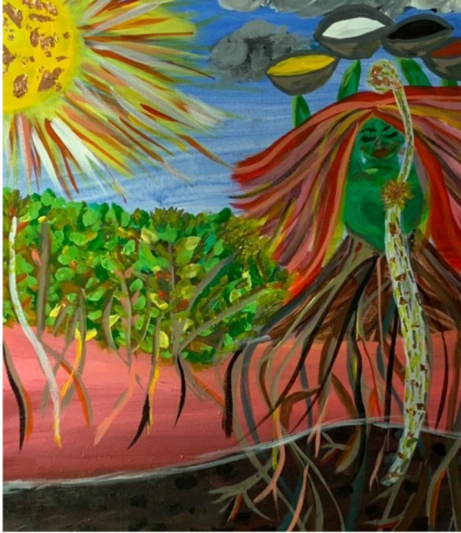
Figure 3. Unattainable Belonging [Painting]

profound transformation in my perspective. I believed that although my childhood was fraught with hardships, I stood at a precipice to speculate a future that is more joyful and meaningful overall. This was a transformative paradigm shift. Cranton (2008) suggested that