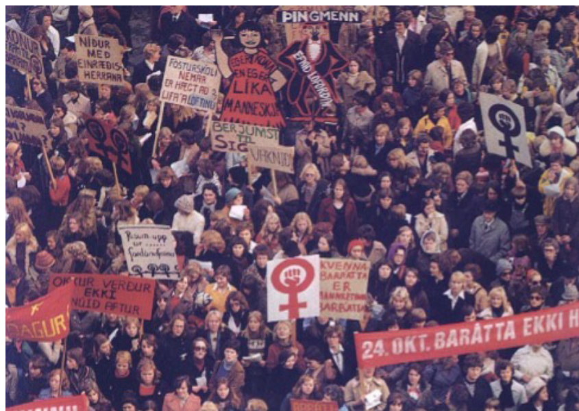
FIGURE 1 Icelandic Women's Strike, 1975.

What is interesting about this particular case of refusal of paid and unpaid labour is the high degree of solidarity and expression of social power, as seen in Figure 1 below.