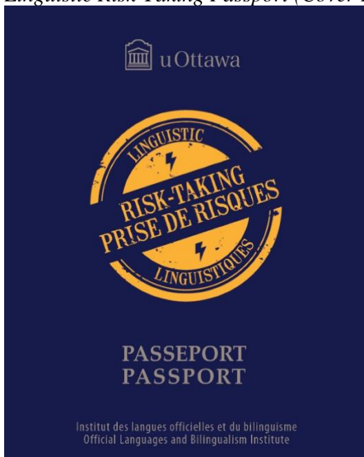
Linguistic Risk-Taking Passport (Cover Page)

The Passport currently contains over 80 such risks that range from using the second language at the library, cafeteria, or sport services, to applying for a job, speaking to a superior, singing karaoke, or submitting an academic assignment in the second language (i.e., foregoing the right to submit an assignment in the first language). The Passport exists in equivalent versions in French and English, and participants are given the version in the target language they are learning. Explanations of the construct of a linguistic risk and why it is important to take risks in language learning are included. Most risks can be repeated up to three times, which offers learners opportunities for repeated exposure to similar situations or tasks. Learners use the Passports autonomously, outside of class time as a motivational, strategic, and record-keeping tool in their daily language practice. They can choose which risks are appropriate or interesting for them and check them off in the Passport once taken. In addition, learners are asked to indicate whether they perceived each risk as High, Medium, or Low at the time they took it. Sample risks are provided in Figure 2, which represents a page from the main section of the Passport for an English learner (the risks for a French learner are equivalent).