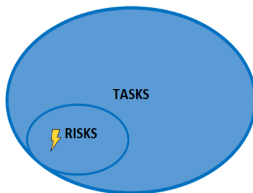
Risks as a Subcategory of Tasks

We believe this conception brings a certain new dimension to TBLT or at least addresses possible gaps in previous thinking and practice. As Ellis et al. (2020) point out, TBLT's focus "has been primarily on the cognitive dimension of learning" (p. 172), even though it is also compatible with experiential learning. In this sense, the notion of risk can add value to the TBLT field by highlighting tasks with experiential and emotional aspects. Defining risks as a special category of tasks raises questions related to individual learner variables. As indicated earlier, risks are dynamic. What some learners perceive as a risk would be perceived as just a task by others. In this sense, it becomes difficult to define a priori which tasks fall within the subcategory of risks indicated in Figure 2. It is precisely for this reason that the operationalization of risks in the Linguistic Risk-Taking Passport is learner-driven. The passport explains to learners the concept of risk and asks them to choose what constitutes risk for them from an extensive list of items, and to engage in