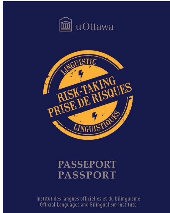
Sample Risk-Taking Pages from the English Version of the Linguistic Risk-Taking Passport