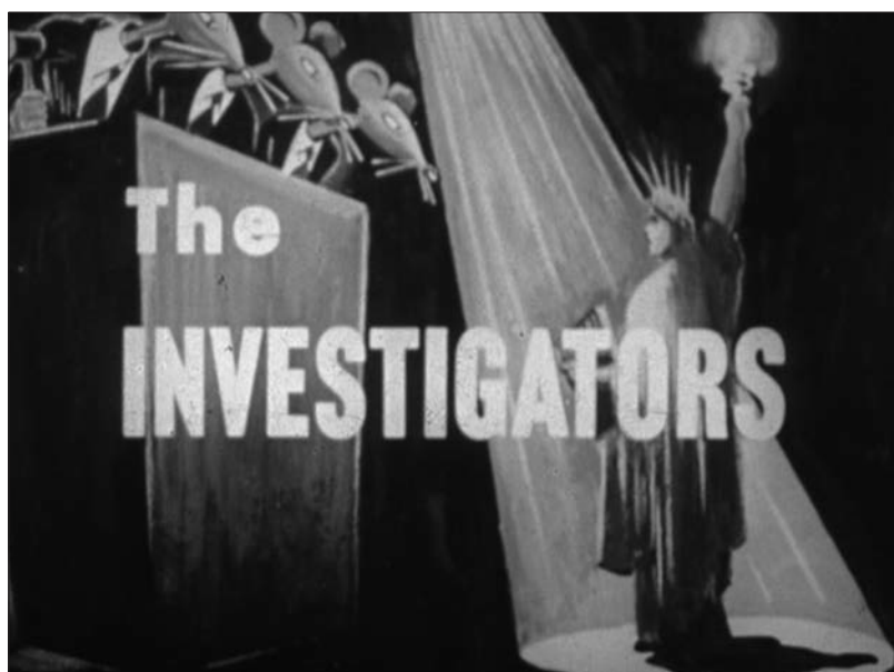
Figure 3a: Frame enlargement from The Investigators (1948).