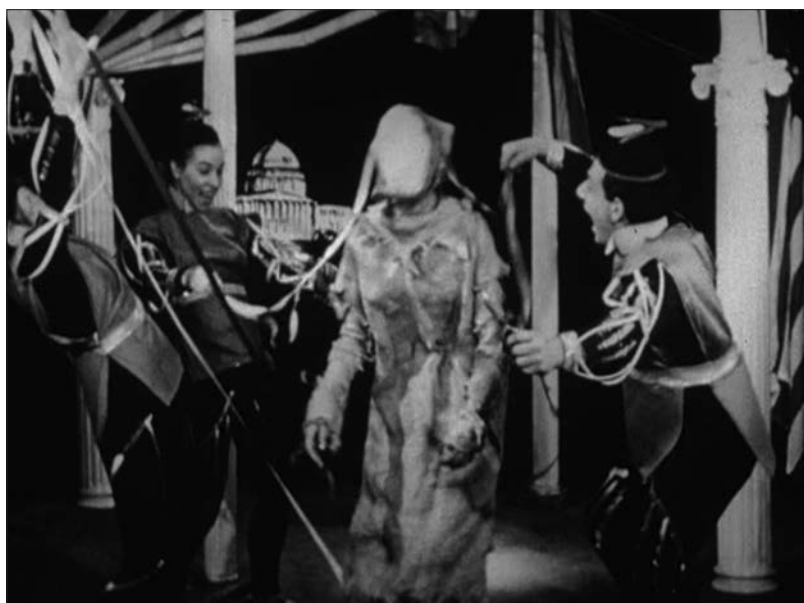
Figure 3b: Frame enlargement from The Investigators (1948).