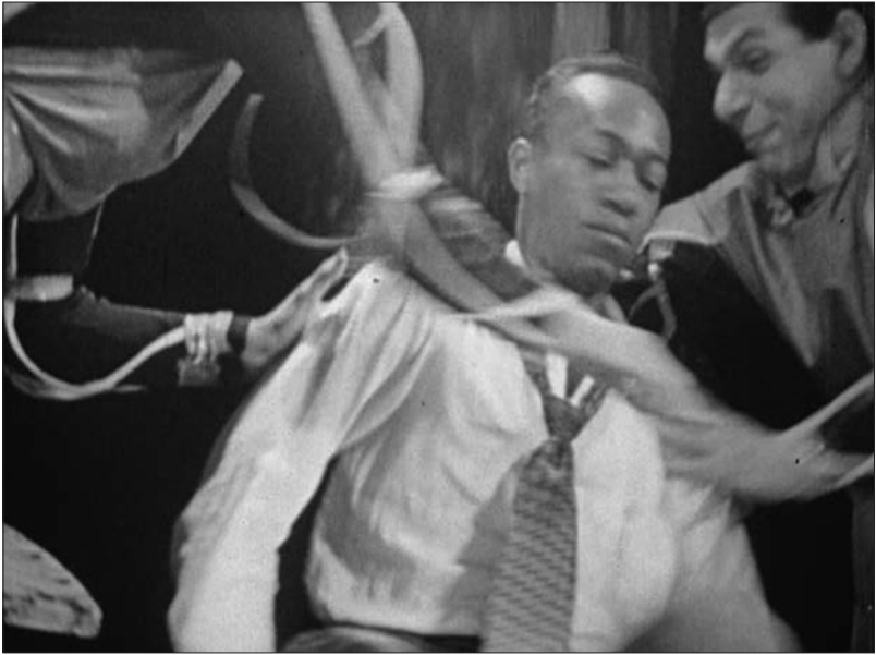
Figure 3c: Frame enlargement from The Investigators (1948).