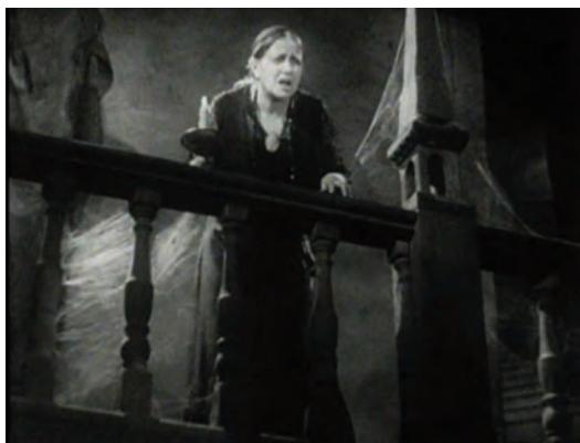
Fig. 10. Shot 1.