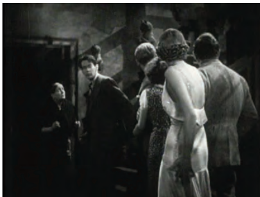
Fig. 2. ...implore...