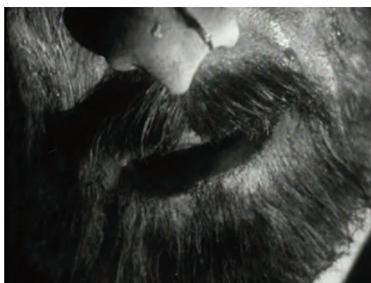
Fig. 17. Shot 1.