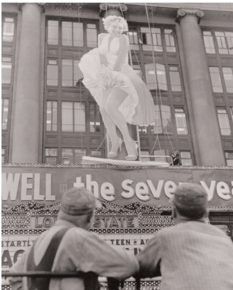
Figure 4. Fifty-Two Foot Figure of Marilyn Monroe Installed at Loew's State Theater, New York (19 May 1955). U1084468 RM

These images of Marilyn Monroe with her dress billowing around her immediately acquired iconic status and have inspired many adaptations and variations in the fifty years since they were taken.