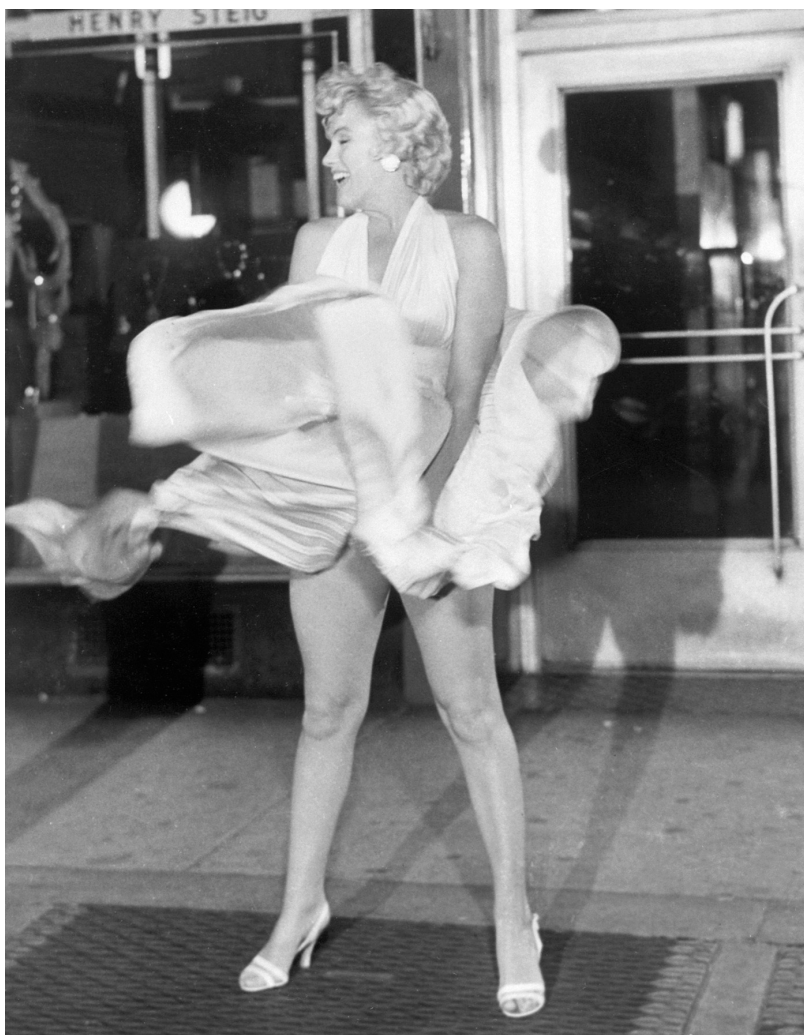
Figure 2. Marilyn Monroe on Subway Grating for “The Seven Year Itch” (16 September 1954). BE037457 RM

ing “the petals of a flower, typically forming a whorl enclosing [appropriately] the sexual organs”) required as much as twelve metres of material and were meant to be worn with matching or contrasting sheer stockings in order to create a style that was at once elegant, feminine and provocative. The original caption to the photograph reproduced here explained: