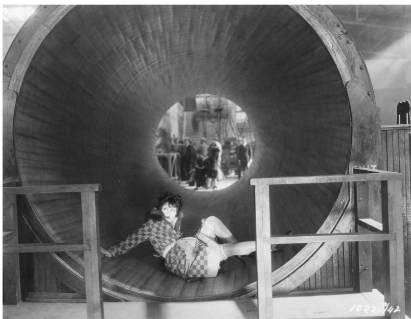
Figure 7. Clara Bow in "IT" (1927). JS1567841

this short film, which lasts a little over a minute, is summarized in a contemporary Edison catalogue: