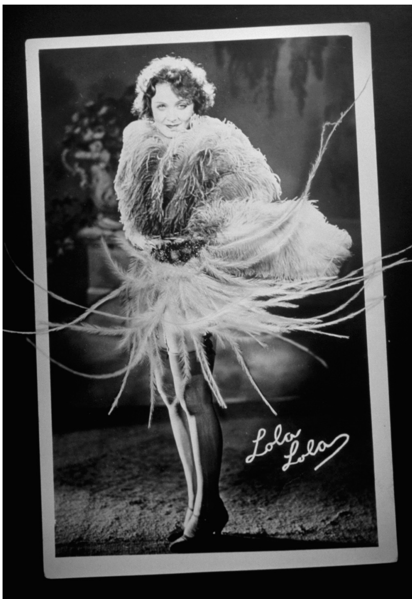
Figure 6. Marlene Dietrich as Lola Lola in “Der Blaue Engel,” postcard from Marlene Dietrich’s personal effects (1930). 0000289437-028 RM

could see how she was made [my italics].” 15 Such cards may themselves be linked to the tradition of photographic flick books, Mutoscopes and Kinoras, mechanized forms of which