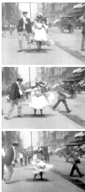
Figure 8. Thomas A. Edison, Inc., “ What Happened on Twenty-third Street, New York City ” (1901). Library of Congress Motion Picture, Broadcasting and Recorded Sound Division, Washington, D. C.

and street traffic before the actors—a man in summer clothes and a woman wearing an ankle-length dress—enter and walk toward the camera. They pause as they cross a grate on the pavement and the escaping air blows the woman’s dress up to her knees (figure 8). 21