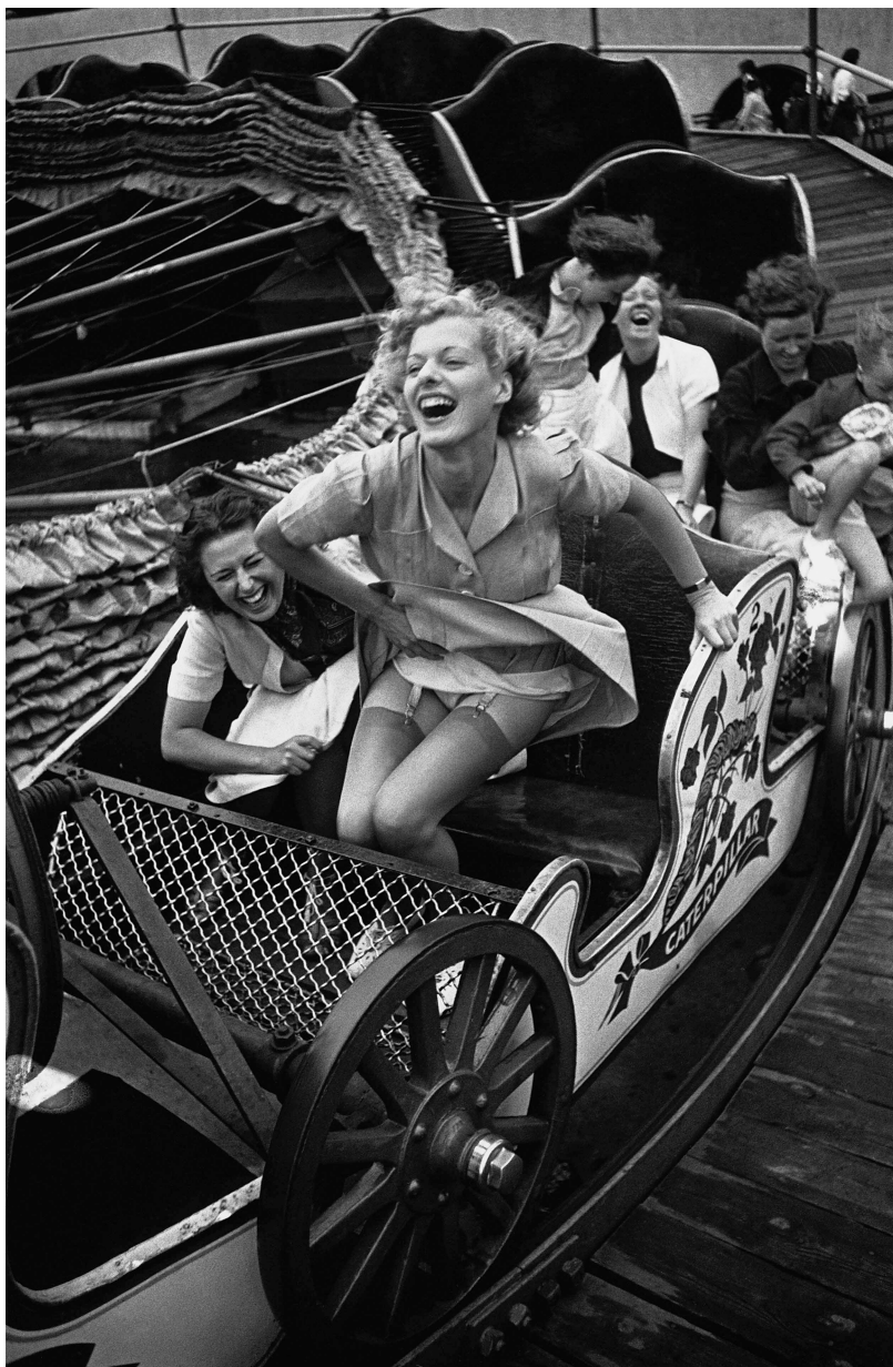
Figure 10. Kurt Hutton, Young Women at a Fair , silverprint (1938). HU010261 RM © Kurt Hutton/Hulton-Deutsch Collection/CORBIS

or at a fair, in high spirits and among friends. There is evidently an element of the ritual of courtship in this voluntary exposure.