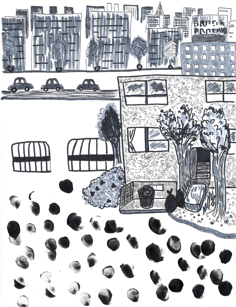
Figure 7. My Childhood Memories of Minato Ward, Tokyo. 1994. Hand drawing by Y. Nakasato (2024)

After comparing my drawing with DALL-E's images, I appreciated my art more than ever because it fully reflected my random memories. As Bau Liu (2023) notes, "Of course, it is to be expected that the creativity of AI art still has its limitations now. A significant proportion of what AI art has achieved so far is within the existing human artistic disciplines" (pp.815-816).