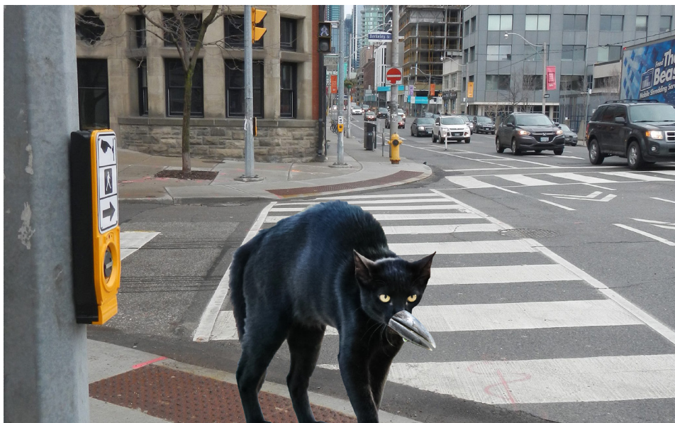
Figure 2. Created by Yasuhito Nakasato on March 8th, 2023. Title: Black Cat with A Beak in My Dream . Medium: Adobe Photoshop. I picked a photo of a black cat from Google Images, then used Photoshop to add a beak to its mouth.

For Imaginary Mountains , with vague memories or the dream yet animated with powerful lingering emotions, I initially doodled lines and mountain shapes on green paper, which I then scanned and imported into Photoshop. After selecting random images of leaves and sky from a search on the Google platform, I copied them onto layers in Photoshop and placed them in front of and behind the mountains I had drawn to enhance depth and atmosphere. Additionally, I adjusted colours and perspectives to ensure visual coherence and realism.