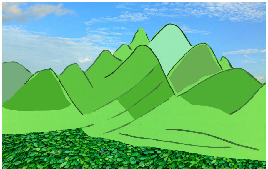
Figure 1. Created by Yasuhito Nakasato on February 23rd, 2023. Title: Imaginary Mountains . Medium: green paper, pen and Adobe Photoshop. Doodling mountains are evolving into more realistic depictions.

To bring my vision to life, which was based on the dreams I shared on February 23rd, 2023, and March 8th, 2023, I used my own illustration skills with Photoshop to create Imaginary Mountains and Black Cat with A Beak (Figure 1 and 2) along with images found on the browser Google through specific keyword searches.