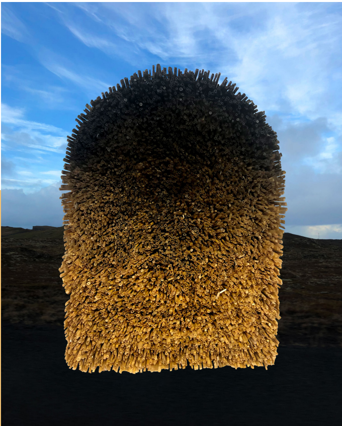
Figure 1. Sasha Shevchenko, Жнець (Reaper) . Straw, pine wood, black mica paint, digital photography, 32 x 24 cm (2020)

For more information, you are invited to visit 113Research at https://www.113research.ca/2022/08/anthropogenic-anxiety-opening-september.html