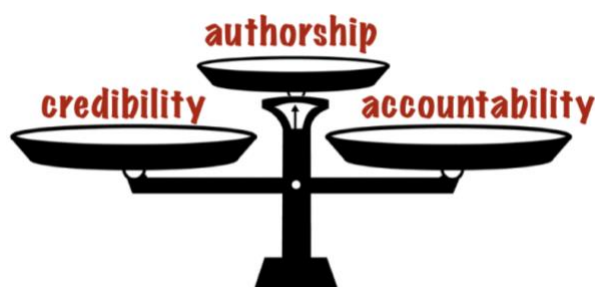
Figure 1. Authorship equation

Researchers should familiarize themselves with proper authorship practices in order to protect their copyrights from research fraud. Moreover, researchers should be aware of the authorship practices within their own disciplines and should always abide by the requirements stipulated by a prospective publishing journal. As some journals require processing and/or publication fees, financial issues should be settled and agreed upon early in the research process to avert subsequent disputes. The Committee on Publication Ethics (COPE) has a guide to help researchers navigate authorship issues (6). Detailed management of authorship disputes is beyond the scope of this article.