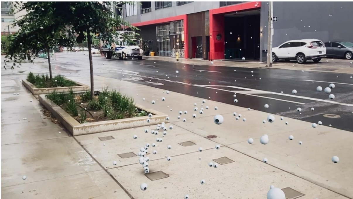
Figure 3: Under Their Eyes AR Installation—Downtown Toronto

On November 18 th , 2023, we invited participants to experience the Augmented Reality (AR) installation as a walk-and-talk activation in downtown Toronto. Participants had the opportunity to share and reflect on similar lived-experiences, events, and frictions they endured on digital spaces. The route of the installations was (poetically) selected to be in front of the Meta, LinkedIn, and Twitter/X headquarters to assert fem(me)inist digital agency and resistance.