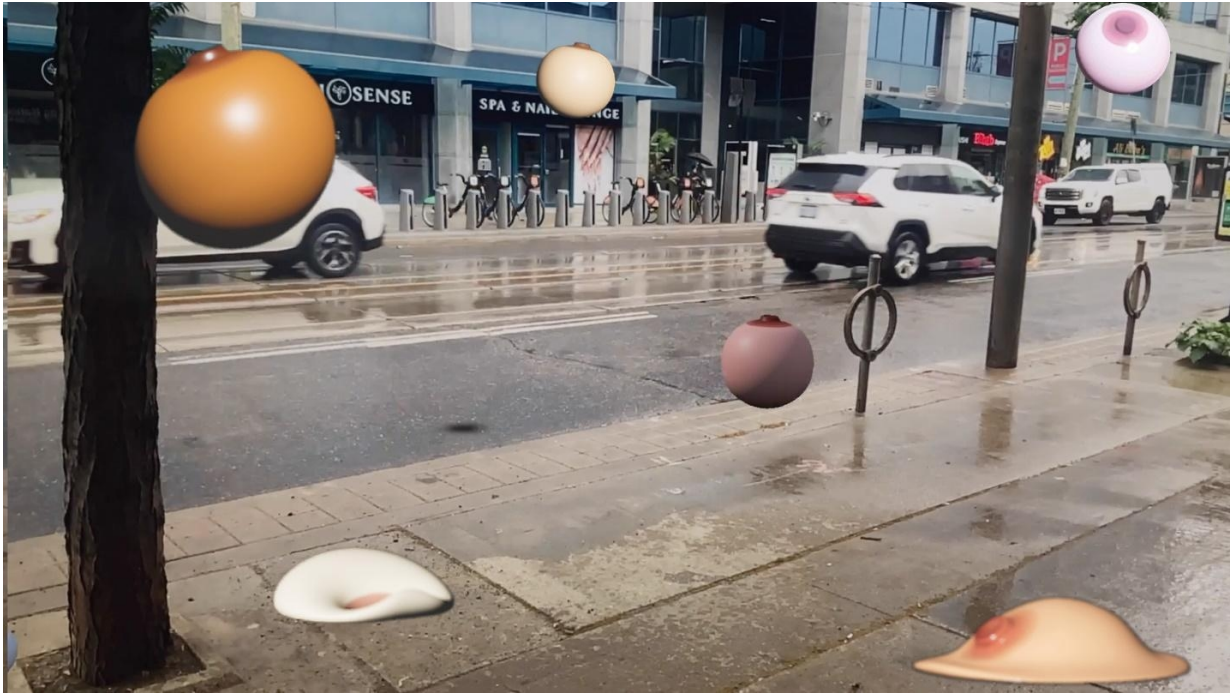
Figure 5: Possessed AR Installation—Downtown Toronto

My body doesn't feel my own online. It is everyone else's to comment on, mock, and objectify. Being harassed in real life is bad, but online, I have no control—it's just so easy, so mundane, so frequent, so immediate, one click—and you're harassed. Your digital body is just 'there' as an open invite to be advanced on, commented on, digitally grabbed, edited and pinched. Where are these body freedoms that digital space promised us? Or was it the freedom to abuse others' bodies they were talking about?