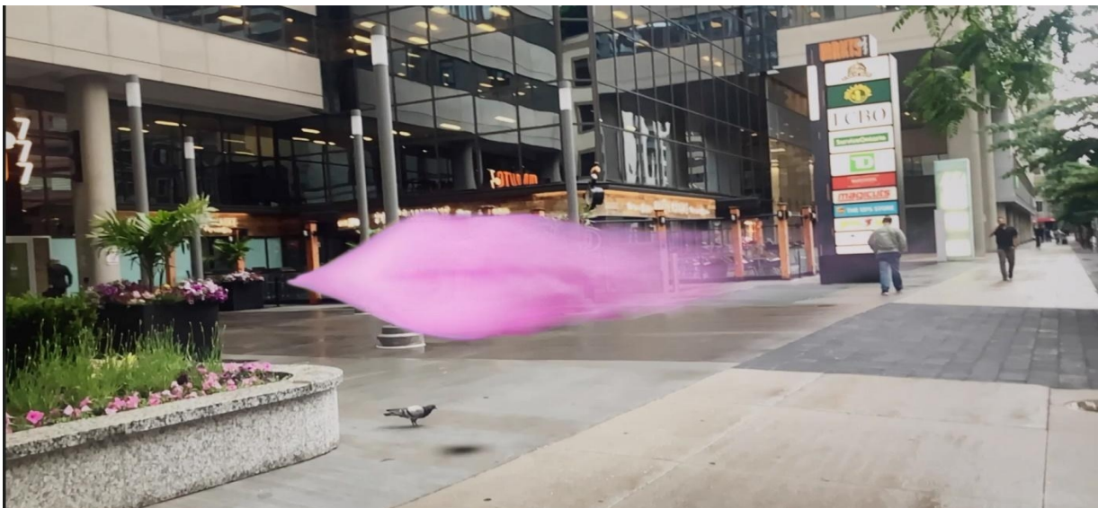
Figure 6: Hush AR Installation—Downtown Toronto