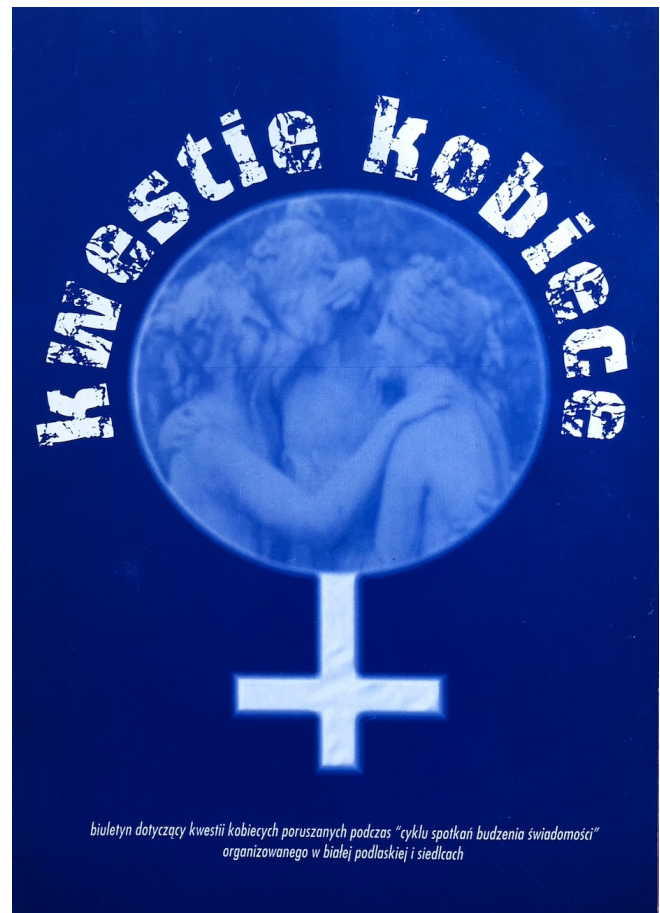
Figure 3: The cover of the brochure kwestie kobiece published by the Wiedźma group with the financial support of Fundacja im. Stefana Batorego . The publication date of the booklet is unknown.

cially evident in the opening text of the pamphlet where the editors state that domestic violence and sexual abuse affect the entire society, and therefore concern everyone regardless of gender, age, or sexuality. In the brochure, which resembles a glossary of terms, the group defines sexual abuse as “undesirable conduct that undermines the dignity of women and men” and domestic violence as “any type of physical, sexual or psychological violence that threatens the safety or well-being of any family member” ( kwestie kobiece n.d., 2). As the authors further summarize, violence rooted in gender stereotypes affects all individuals.