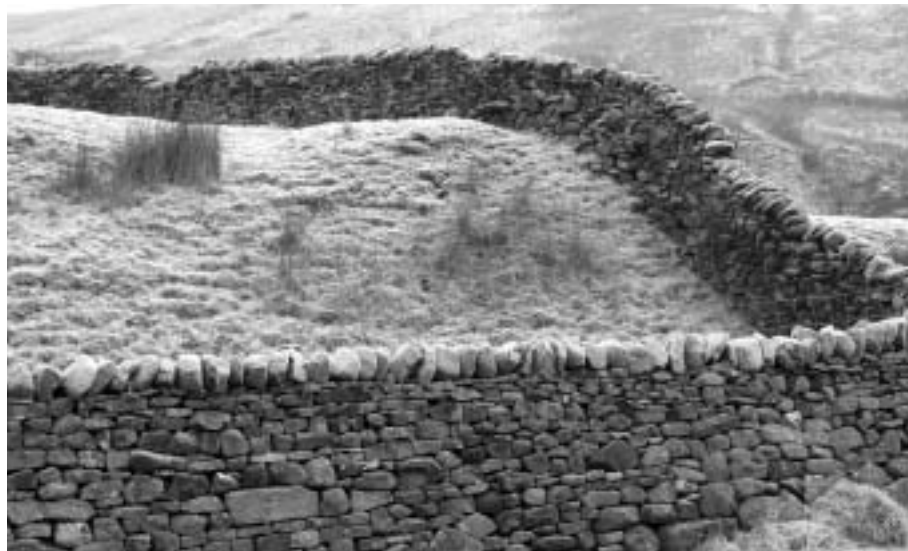
Fig. 6 Dry stone walls

Reflecting on these experiences and findings, and referring to a previous study that looked at objects used as aids for inner development and contemplation, (such as the Buddhist prayer wheel, prayer beads and the Jewish prayer shawl) (Walker, 2006, 39-51) I was reminded of references to an ancient type of tallying device used for keeping track of meditative sayings or prayers (Schaff, 1886, 367; Schaff, 1889, Ch.32; St Paul, 2000, 24). The 'device', used since the 3 rd century, consists of a simple pile of stones. To keep track of the spiritual exercises, each time a saying or mantra is completed, a stone is moved from the pile, to form another adjacent pile. Combining such a device with the local cottage industry of weaving would enable a simple, illustrative, functional object to be produced that would fulfil all the priorities set out for the project.