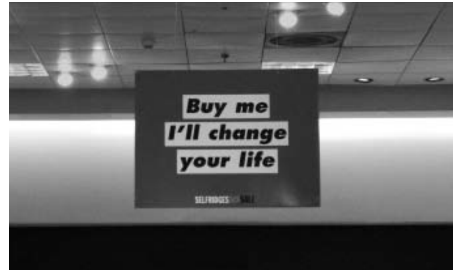
Fig. 1 Marketing banner “Buy Me”, Selfridges department store, Trafford Centre, Manchester

I’ll change your life” and “You want it, You buy it, You forget it” (Fig. 1). Similarly, the U.S. auto manufacturer Hummer, which has received criticism for its oversized vehicles aimed at the consumer market, launched a TV commercial that focused on a man buying vegetarian produce who is later seen at the wheel of a Hummer, accompanied by the line “Restore the Balance” (Hummer, 2006). By employing irony and humour, such examples demonstrate the infinite adaptability of industrial capitalism, which allows it to undermine virtually any form of critique (Miller, 2005, 2).