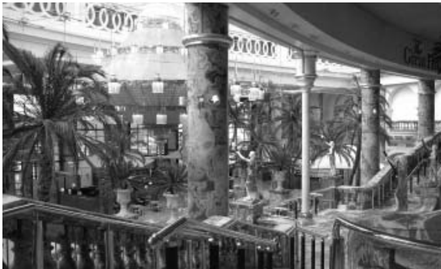
Fig. 4 Grand marble and brass staircase, Trafford Centre, Manchester

These kinds of products and services exacerbate already severe environmental problems – directly through their contribution to cumulative effects and indirectly through the dissatisfaction and cravings they foster.