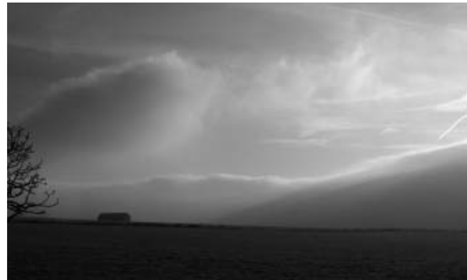
Fig. 5 Countryside adjacent to author's place of work

Bearing in mind these priorities and considerations, the rural area immediately adjacent to my place of work was visited (Fig. 5). It is a place of high moors and deep fertile valleys. The main occupation is farming, and the predominant sight is dry stone walls enclosing pastures filled with different varieties of sheep. Streams and rivers cut through the moor land, with gravel beds and ancient stepping stones, and stone farmhouses and barns stand out on the horizon (Figs. 6-9). Research about the area revealed a small cottage industry of rare-breed sheep rearing, together with the spinning and weaving of their wool.