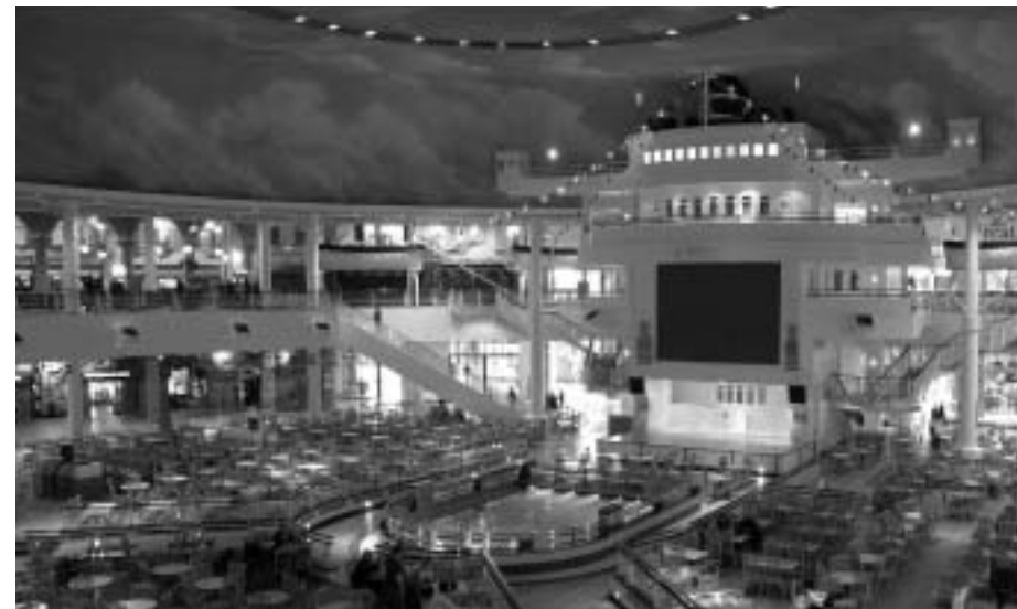
Fig. 3 Food court ‘Ocean Liner’, Trafford Centre, Manchester