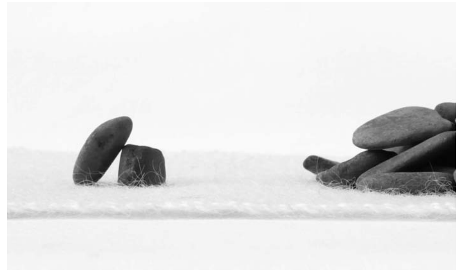
Fig. 15 Sustainable artefact, detail 2