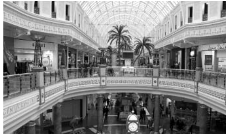
Fig. 2 Main concourse ‘Palm Court’, Trafford Centre, Manchester

such aspirational products, available only to the few, may cultivate vanity, envy and discontent, the proliferation of less expensive products creates even broader problems. For example, the recent launch of the world’s cheapest car, by Indian automaker Tata, (2008) will help further transform India into a high consumption society.