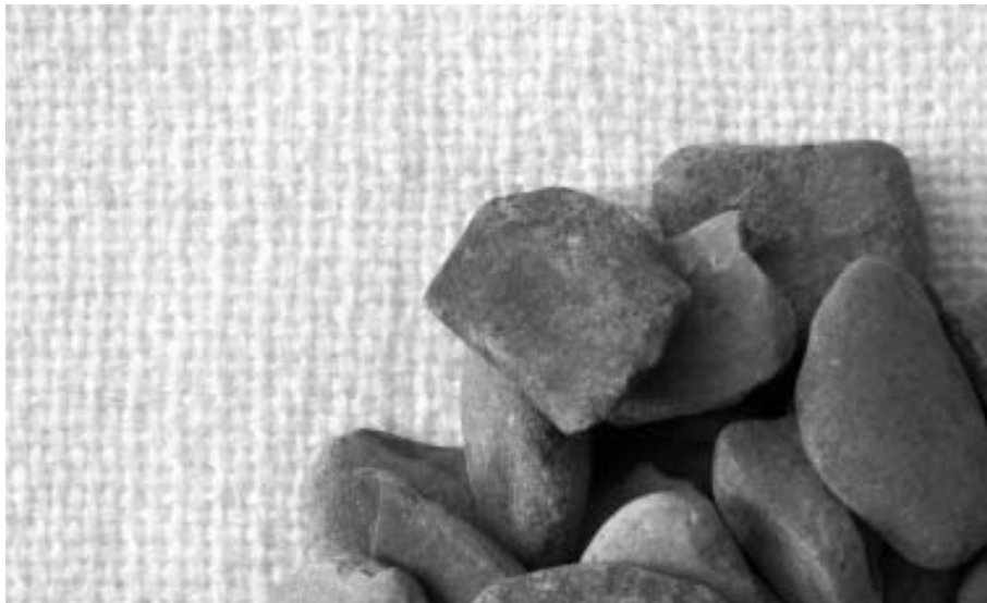
Fig. 13 Sustainable artefact: a 'tallying device' – 33 river stones on a woven cloth