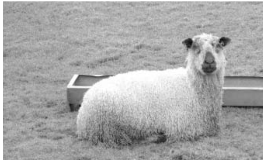
Fig. 11 Teeswater rare breed sheep