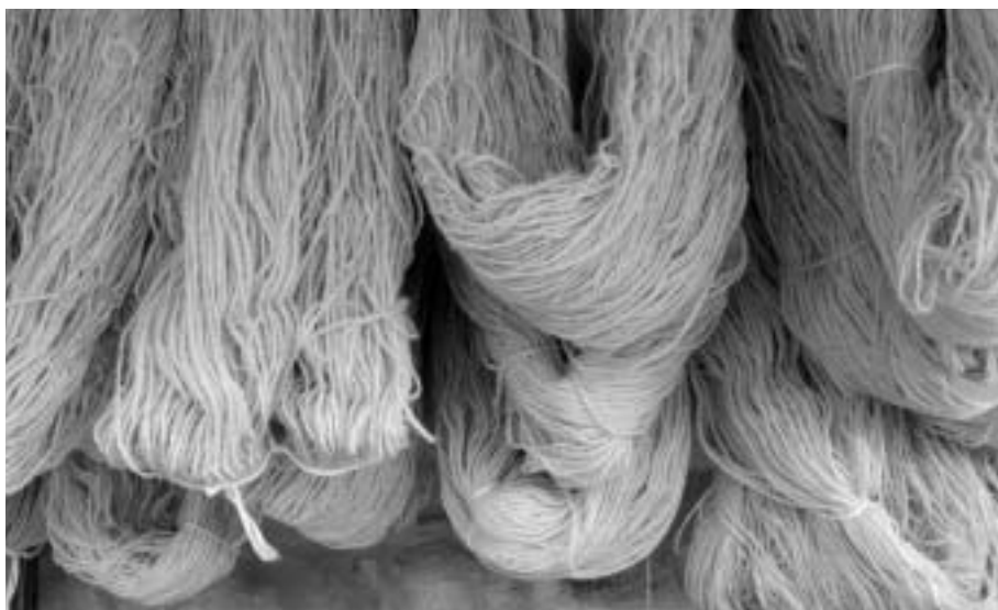
Fig. 10 Wool from Teeswater sheep