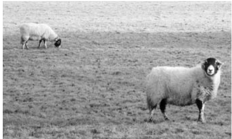
Fig. 7 Sheep pasture

woven on a small hand loom, was ready (Fig. 12). The stones were then placed on the cloth to form the simple 'tallying device', and the artefact was complete (Figs. 13-15).