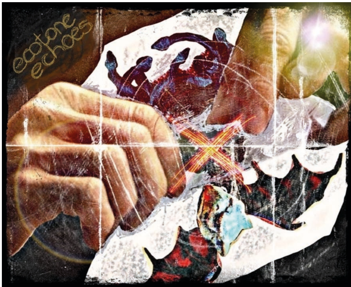
Figure 3 (Un)folding Echoes

Notes: Digital collage by Deborah Green, 2024.