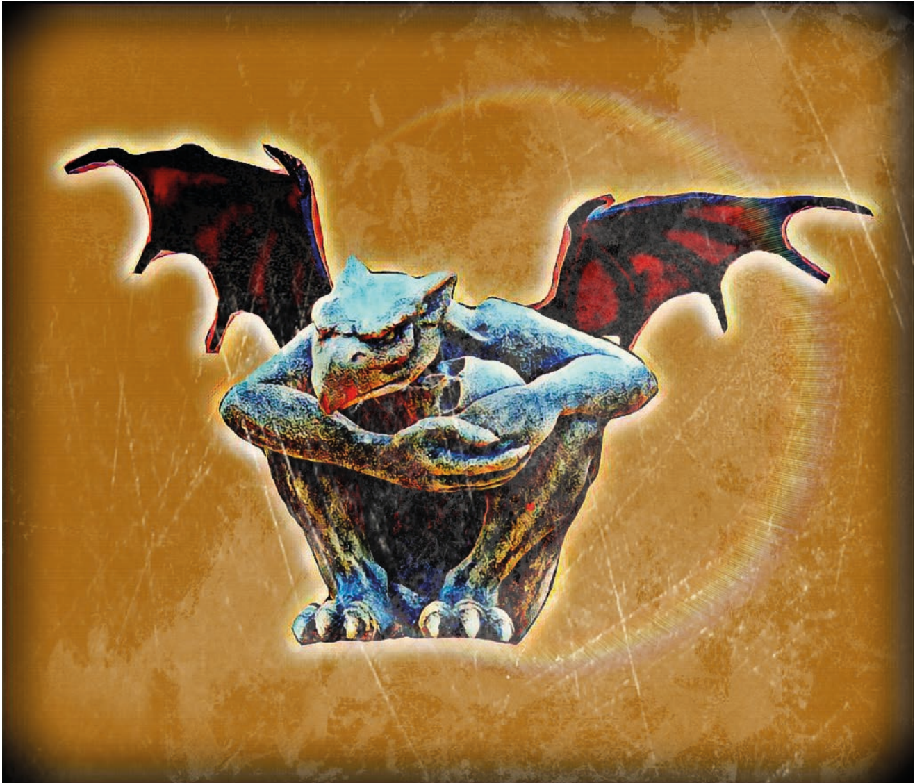
Figure 1 Scarcity-Gargoyle

Note: Digital collage by Deborah Green, 2021.