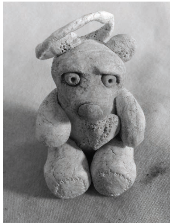
Figure 5 Shy-Sage

Notes: Paper clay and ash by Deborah Green, 2015a, p. 170.