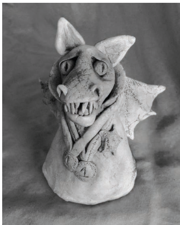
Figure 4 Vampy-Croc

Notes: Paper clay and ash by Deborah Green, 2015a, p. 156. Vampy-Croc