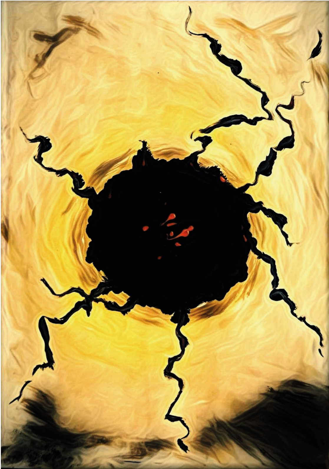
Figure 7 Dark Soul-Caldera

Notes: Paint on paper by Deborah Green, 2021.