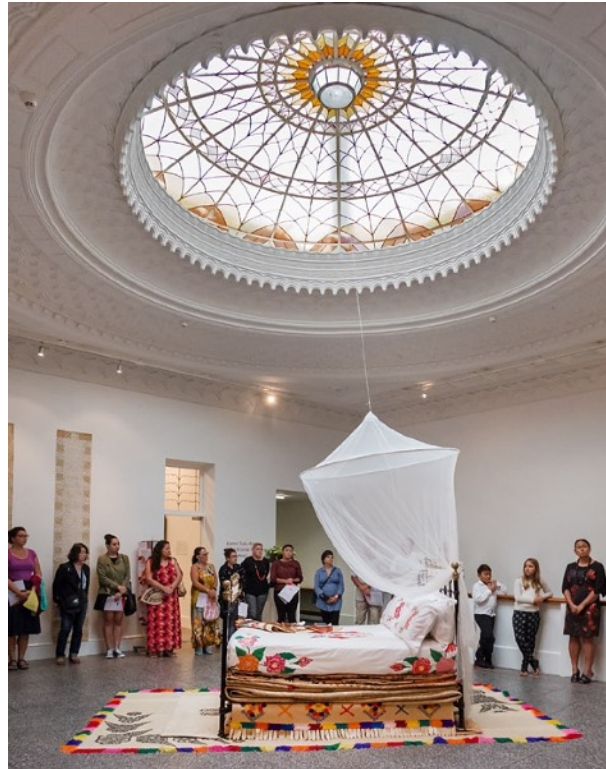
Figure 7 Aunty Ungatea's Bed

Note. Gus Fisher Gallery, University of Auckland. Opening night of Kofukofu Koloa.