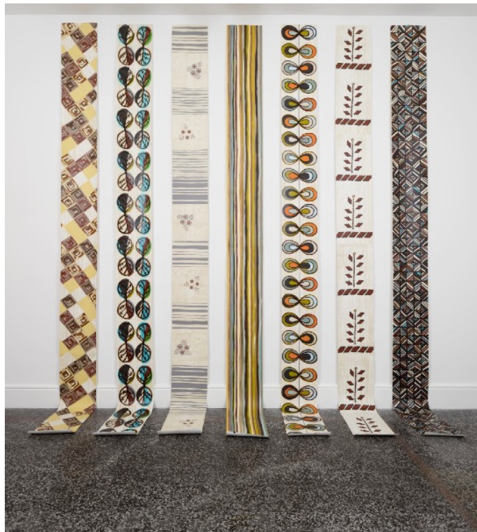
Figure 9 Seven Sisters

Note. 2016, Acrylic and Indian Ink on archival relief printed paper. Each 410 x 4200mm.