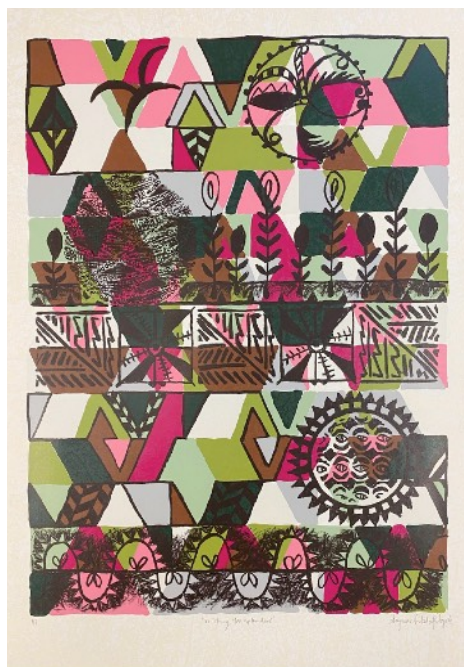
Figure 11 Relishing the splendour

Note. 2021, Limited edition screen print. 0950 x 0650.