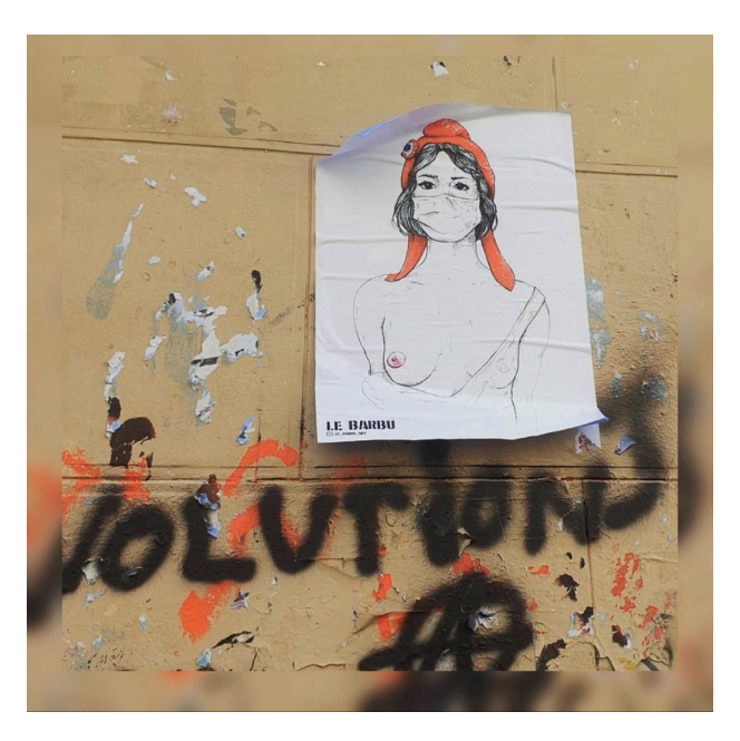
Illustration 1. "Phrygian bonnet, surgical mask."

As there is no useful way to define a "parisien" or a "montmartrois," I do not use these denominations. My interlocutors and I shared the same space at a singular moment in which residents were essentially the only people in Paris (an unprecedented phenomenon in a city with approximately two million residents that is flooded daily by up to ten million people from the suburbs, in addition to tourists). I moved to Montmartre in 2016 and remained there throughout confinement. Emptied of outsiders and those who could escape their small apartments for the countryside, the social and physical proximity of Montmartre was amplified.