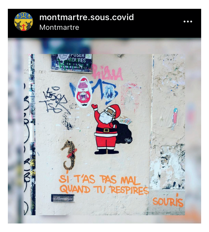
Illustration 2. "If it doesn't hurt when you breathe, smile."

Parisian outdoor culture. Given the price per square foot in Paris, Parisians spend their lives outdoors—exercising, eating, relaxing, reading, and protesting in the city's open spaces. Even when confined, the city's outdoor culture persisted.