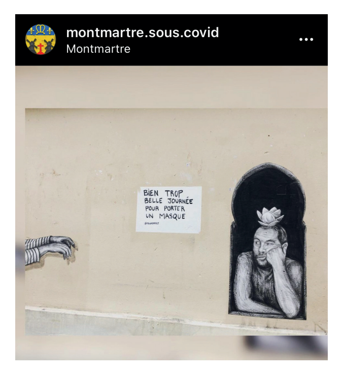
Illustration 4. "Far too nice a day to wear a mask."

beliefs, ideologies and precedents provide the theoretical system for understanding and responding to disease.