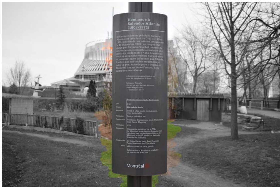
Figure 4. Montreal, commemorative plate in Jean Drapeau Park, 2017.