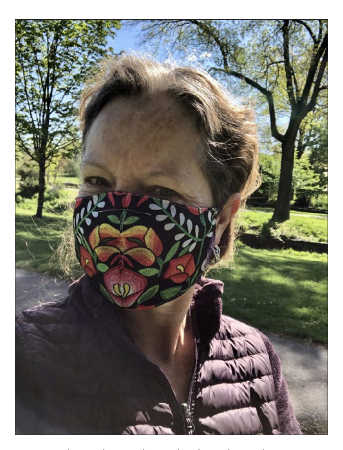
The author with mask.

I have been thinking a lot about what it meant to prioritize the common good. I have been thinking about the veil as a way of balancing individual needs with respect for the interests of a larger group. In New Jersey, a capital of fast-paced consumer capitalism, seldom are individuals asked to function in deference to the larger good, or the needs of the most vulnerable. Yet as our governor ordered everyone to stay home and wear masks in public--not for our own protection, but for the protection of others — I recognized that I was being asked to behave in a way that has always been Noor's principal consideration: to act, first and foremost, with others in mind. Whenever she dons a veil to go to the market or pick up her children at school, she signals an effort to balance the demands of home and family, adherence to an ancient faith and a religious community, and her ability to function as a modern woman in contemporary society. As New Jersey residents were asked to mask up when we left our homes to go to the pharmacy or buy food, for many of us it was a startling request by our broader community to think beyond our own needs and convenience and instead