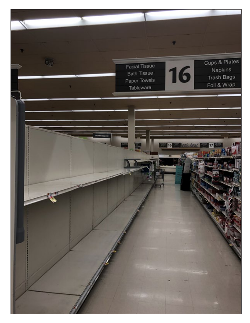
Supermarkets sacked, March 2020.

ordered the nine million residents of our state to stay at home except for necessary travel, and ordered all non-essential businesses closed. We were permitted to leave the house for essential needs, such as groceries, food or medicine, to visit close family members, or visit a doctor. We could go on a walk or exercise outside, but otherwise, we were instructed to stay at home.