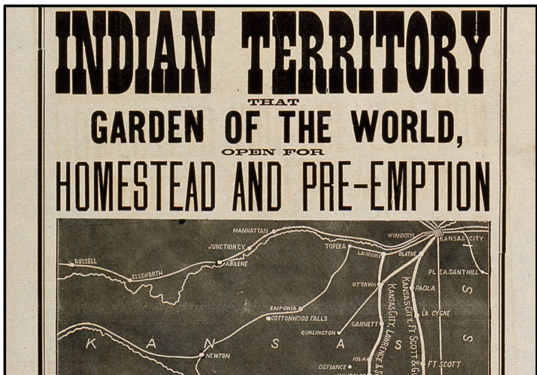
Figure 1. Poster advertising land in current-day Oklahoma. Records of US Army Continental Commands. Record Group 393. NAID 4662607. 1989[ca. 1880].

enabled homestead, preemption, and land title, that the US was able to legally extend its jurisdiction into these western Indigenous lands. It is because these lineages of land title exist, post “discovery” claims, that land-as-property maintains its value and place under US property law. In other words, this is a key aspect of how US colonialism is maintained. Figure 1 below is an 1889 poster run by Kansas City, Lawrence and Southern Railroad Co., advertising Indian Territory as a “garden of the world,” open for “homestead and pre-emption.” 2