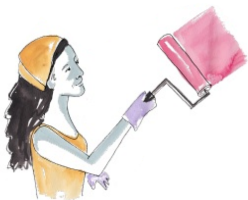
Figure 8. Depicting race: Selma in the Everyday Austerity zine

However, we were careful not to romanticise families' 'resilience', and place too much emphasis on capacities at the household level. Overly focusing on the capabilities of families as the analytical explanation for impacts and recovery from societal hazards moves responsibility for risk towards affected populations, whilst the broader political, economic, social, and environmental structures that shape family resilience are obscured and left unexplored. One of the ways we did this was to ensure that any details about the research and findings are kept slimmed down, placing the focus instead on the stories as placed together, rather than our own academic interpretations. In the Everyday Austerity zine the inside sleeve of the card cover contained a very short introduction and similarly in After Maria there was a very brief introduction, plus 6 pages with information about 'Disasters around the world'.