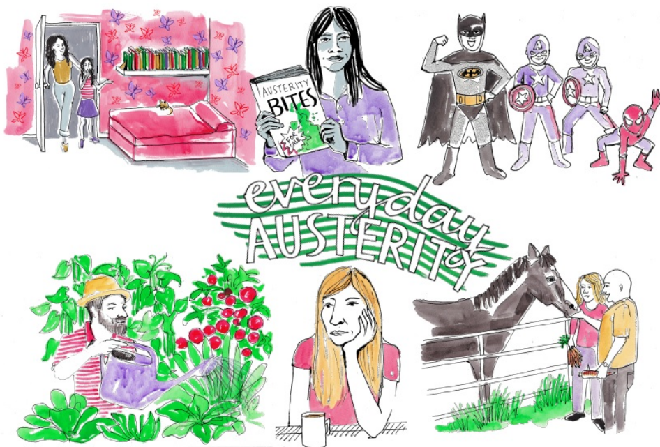
Figure 3. The central image of the Everyday Austerity zine, when folded out

Furthermore, comics and zines have their own vocabulary: gutters, panels, tiers, balloons, bubbles, bleeds, splashes, perspectives, shading, folds, pleats and so forth. These are all elements that carry meaning and which exist meaningfully in relation to one another in the space on the page. Contemporary comics and zines ask us to reconsider several dominant commonplaces about images, including that visuality stands for a second-tier literacy. Notwithstanding, comics and zines involve a substantial degree of reader participation to decode narrative meaning and sometimes subtle imagery. And the visual content of comics and zines that once signaled a "lesser-than" literacy is now an integral part of contemporary daily lives. Primary media intake, especially online, combines the verbal and the visual and often with complexity people learn to navigate quickly (Hattwig et al 2013).