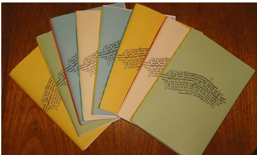
Figure 2. Copies of the Everyday Austerity zine