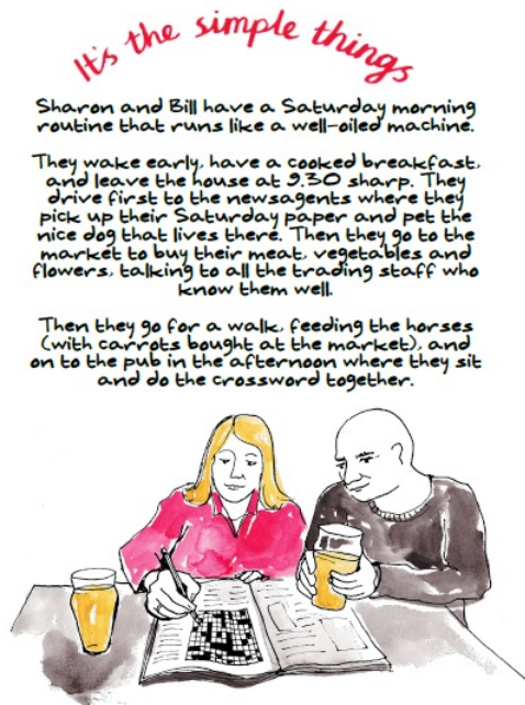
Figure 5. 'It's the simple things', from the Everyday Austerity zine

Visual storytelling also allows researchers to be economical with text in a way that maintains the complexity of findings (Aiello and Parry 2019). A researcher may need 500 words to communicate an idea that can be communicated in a few images, with limited dialogue (Public Anthropologists 2020). Therefore, it is critical to collaborate with an experienced artist who is sensitive to the research findings and also has the skill and intuition to distil ideas into images. Artists require sufficient freedom so they can effectively communicate the ideas presented, meaning researchers must forego some control over the outputs if they are to fully embrace the visual narrative form of comics and zines.