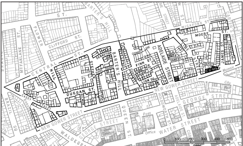
Map 2 – “Old City Centre” of St. John’s