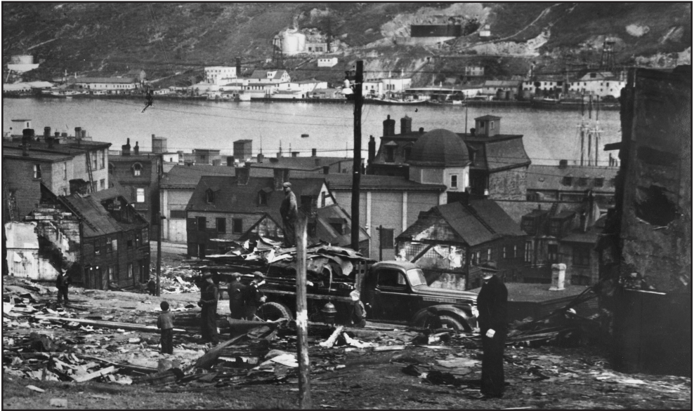
Figure 2 – Clearing the Area near Carter’s Hill