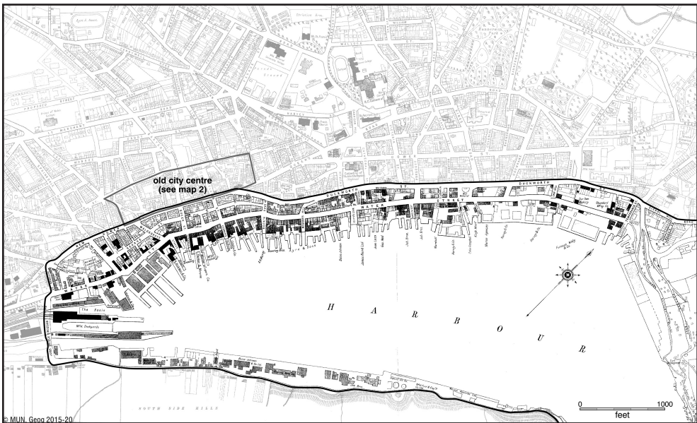
Map 1 – City of St. John's (1932) Depicting the Location of the "Old City Centre"