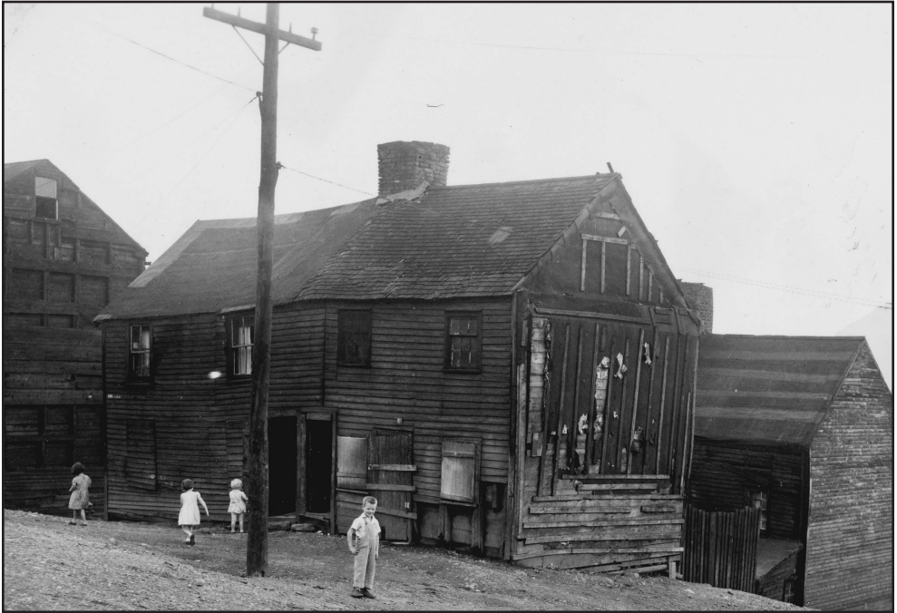
Figure 1 – Simm Street Before the Clearance