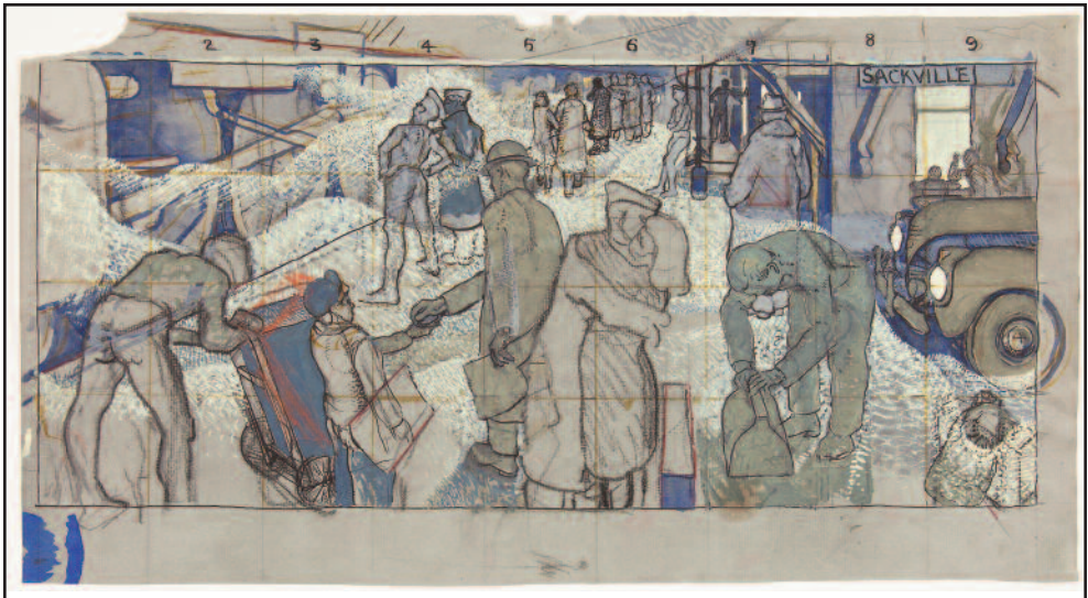
Figure 3: Alex Colville, preparatory drawing for Sackville train station mural (1942).