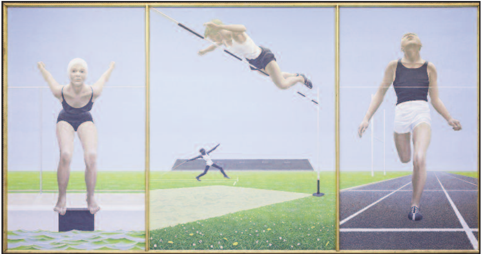
Figure 2: Alex Colville, Athletes (1960), in situ Mount Allison University, Sackville, NB.