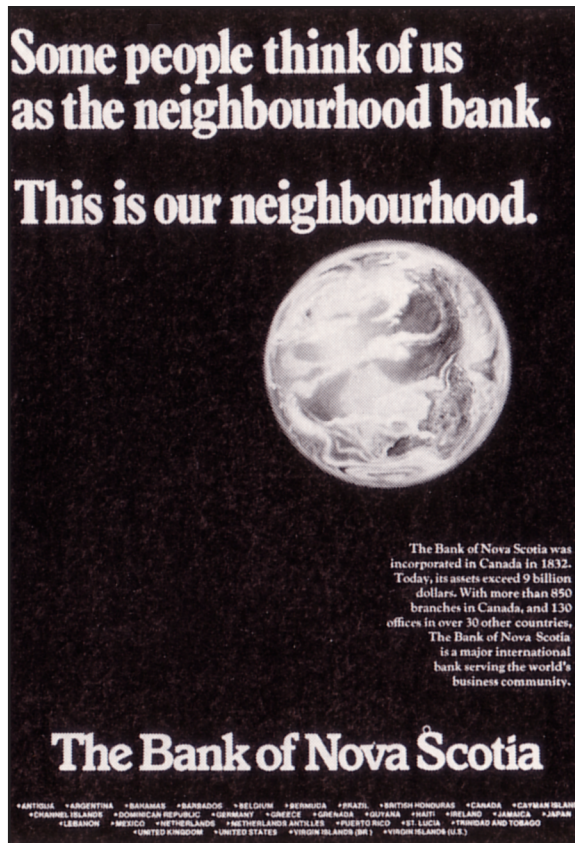
Figure 7: Scotiabank advertisement, early 1970s.