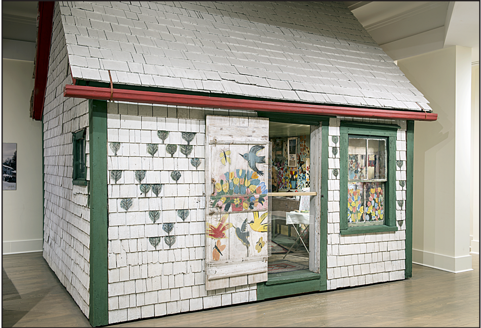
Figure 9: Installation view of the fully restored Maud Lewis House, 4 June 1998, Scotiabank Maud Lewis Gallery, AGNS, Halifax.