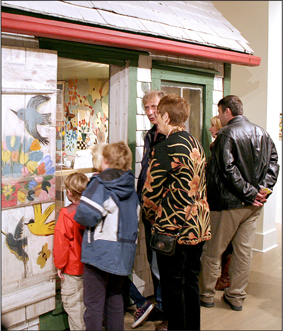
Figure 1: View of the Lewis house with decorated painted exterior and interior, as installed at the Art Gallery of Nova Scotia, Halifax, c. 2013.