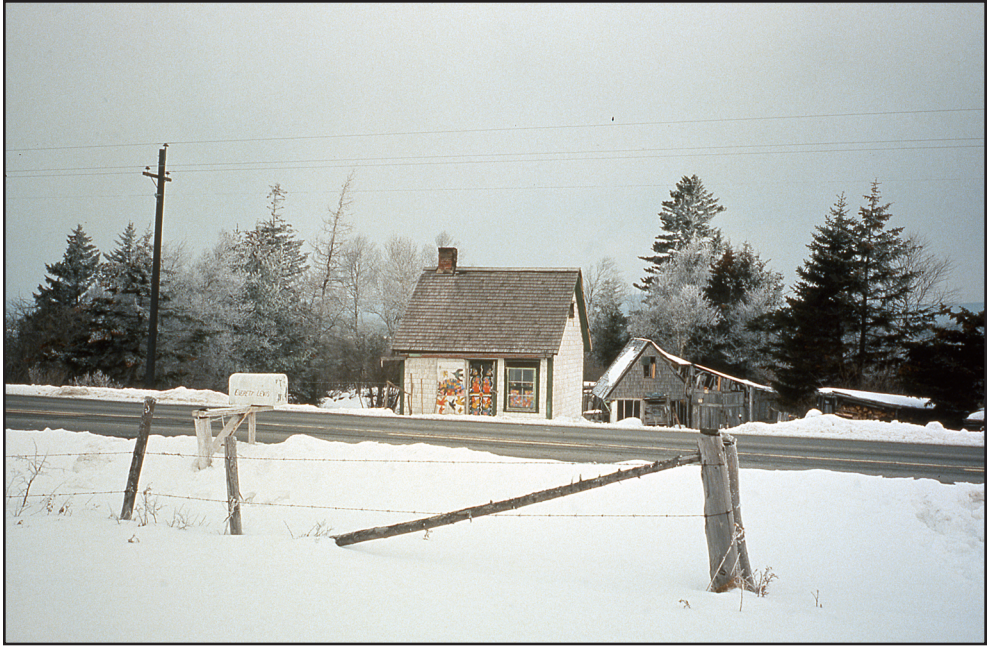
Figure 6: Lewis home, Marshalltown, Digby County, 1965.