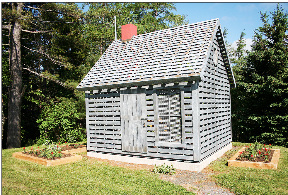
Figure 11: Brian MacKay-Lyons’s memorial cairn on the site of Lewis’s Marshalltown house, 2013.