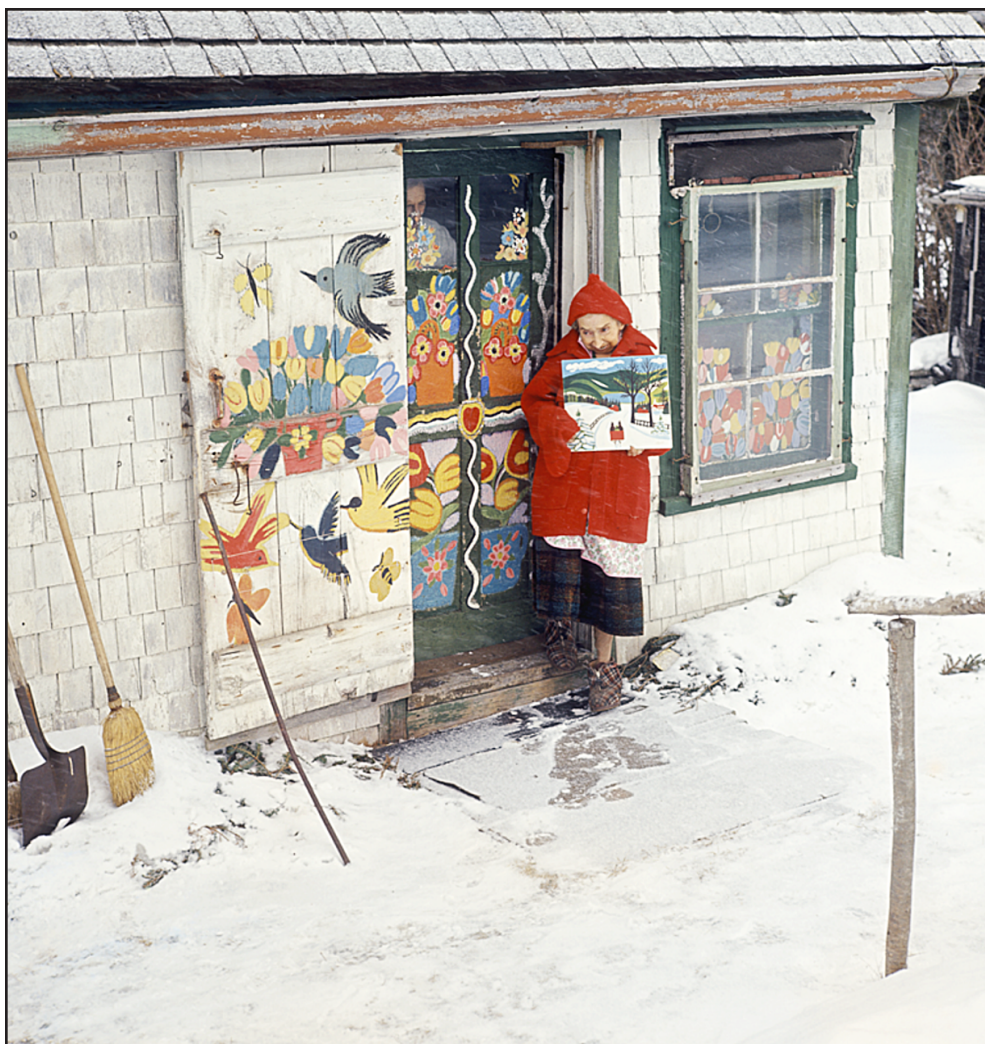
Figure 4: Maud Lewis beside storm door with hummingbird and bumblebee additions, 1965.