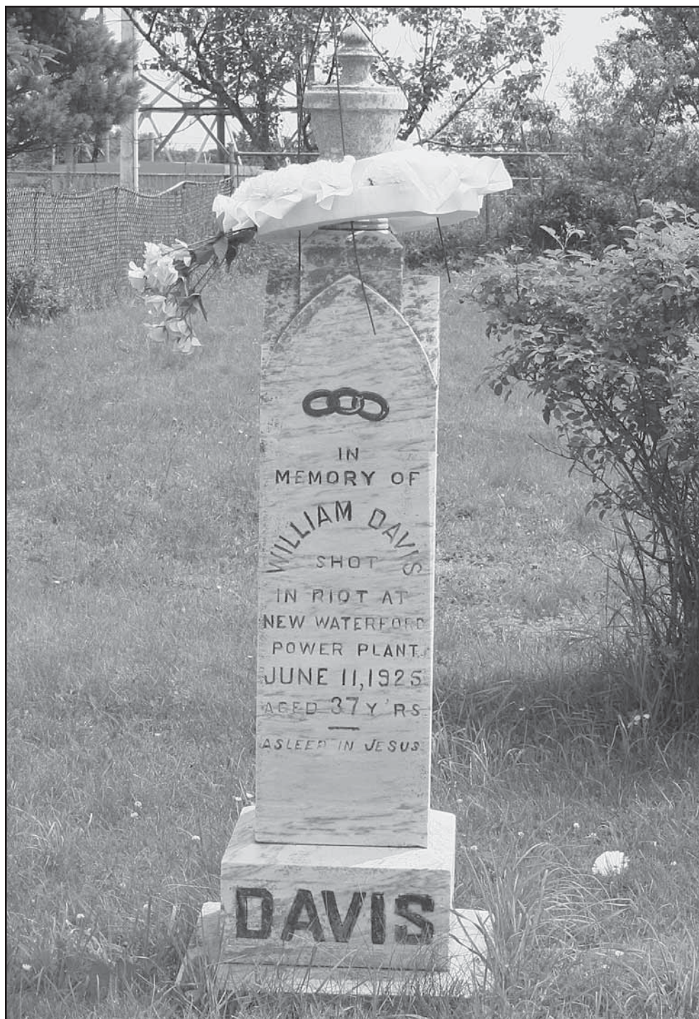
Figure 4: William Davis grave, Scotchtown.