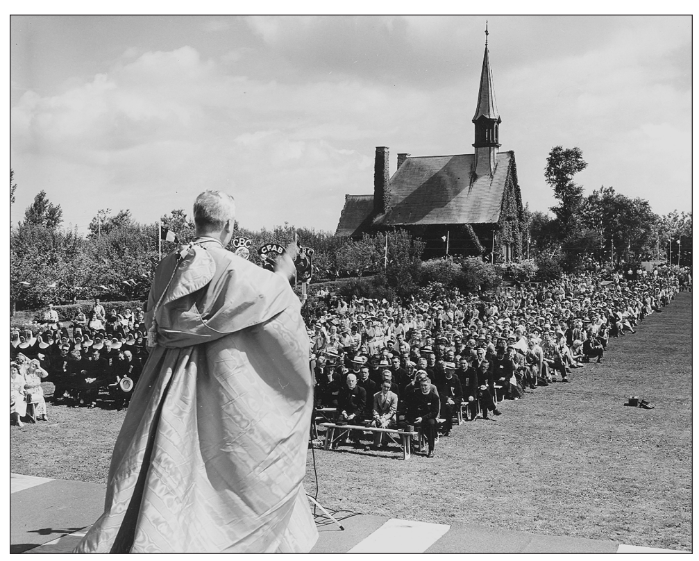
Figure 3: Pontifical Mass held at Grand-Pré during the 1955 bicentennial celebrations. (Centre d'études acadiennes Anselme-Chiasson, PB4-43; PB4-47)

executive members of the SNA were concerned that the deal might have "grave" consequences for the Acadian peoples and were reluctant to sign over ownership of the church. 112 They would only do so if there were specific conditions to which all parties agreed. According to the final agreement signed with the SNA, the government was responsible for recognizing and emphasizing the importance of the site for the Acadian peoples and for giving the church, the museum, and all other monuments within the park a "strictly bilingual character and appearance" as manifested through the employment of bilingual guides, the use of bilingual inscriptions on objects in the museum and outside signs, bilingual information literature available to visitors, and "through all means of physical expression normally found in a national park." The government was also responsible for properly maintaining and interpreting the objects representing the history of the Acadians.<sup>113</sup>