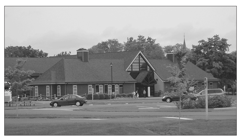
Figure 4: The Grand-Pré Interpretation Centre, 2008.

publication of Evangeline by Felix Octavius Carr Darley were placed on the walls inside the church, creating a visual narrative of the expulsion.<sup>124</sup>