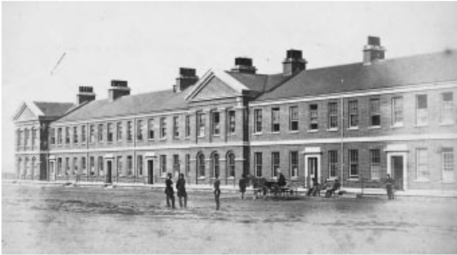
Figure Two The Officers' Quarters, Wellington Barracks, West Face, in 1863, Soon After its Completion