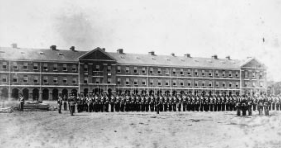
Figure Three The Men's Quarters, Wellington Barracks, East Face, in 1863, Soon After its Completion, Showing the Colonnade