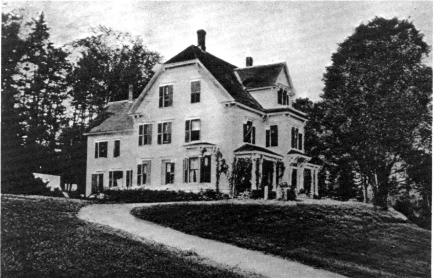
2. The Keeley Institute, Fredericton, N.B. Saint John, N.B. and Vicinity (Saint John, 1895?).