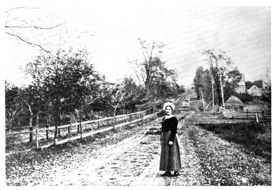
Figure Three: A modern conception of the maid Evangeline, c. 1902

are useful for what they reveal of the taken-for-granted circumstances and daily lives of Kings County residents of the period: the streets and shops of commercial intercourse, the size and settings of dwellings, or the tools and techniques of dyke repair work. Each is testimony to Hardy's sensitive appreciation of the settings in which he lived and worked.