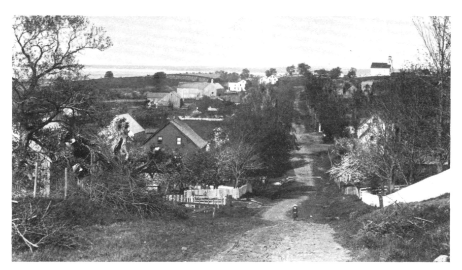
Figure Two: Grand Pré Village showing the original French Road

trade, in which farmers barelled their crop "tree run" and consigned it individually to British brokers. The numerous vessels in Hardy's coastal illustrations mark the now almost forgotten importance of the Minas Basin and Bay of Fundy as commercial waterways. In the decade before the First World War, ships and schooners anchored in Annapolis Gut, sheltered in tiny coves, and lay alongside the wharf in Port Williams; tiny steam ferries, bedecked with flags, plied the coast; small skiffs and dories linked headland settlements divided by deep inlets of the sea; and small craft carried pleasure seekers off Evangeline beach.