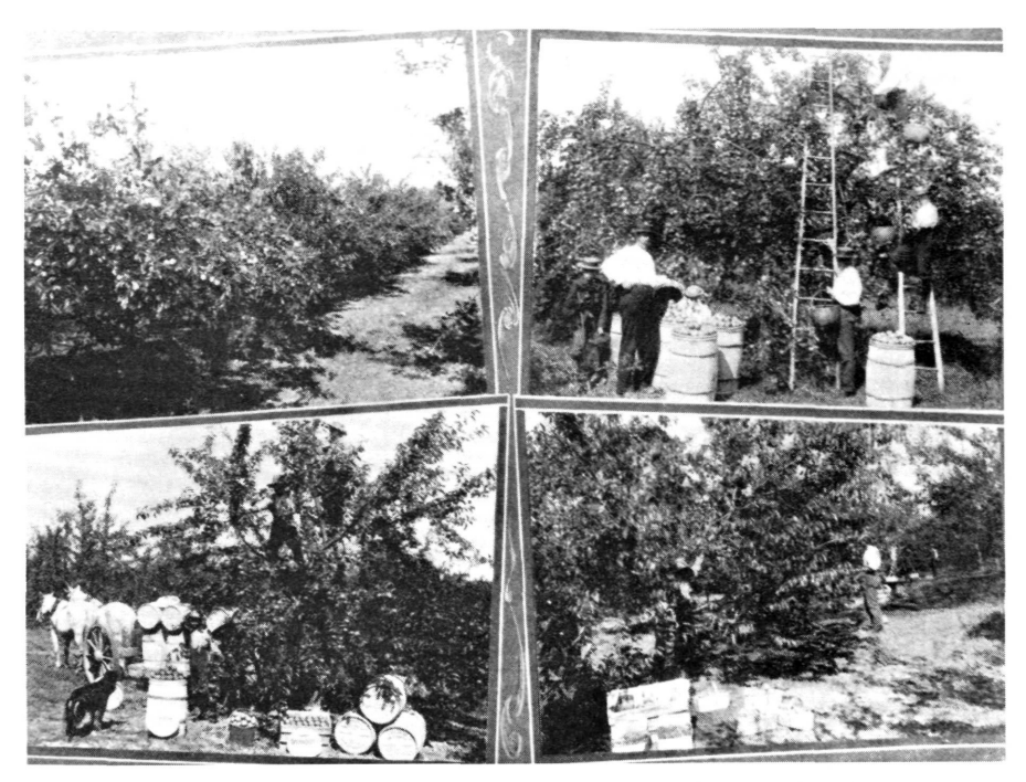
Figure One: Gathering the Fruit

illustrations of Yarmouth, Annapolis, Wolfville, Canning and Halifax; views of land and water capturing the aesthetic appeal of particular juxtapositions; and depictions of the workaday worlds of sawmillers and farm hands.