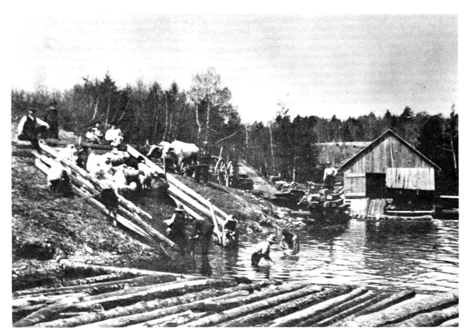
Figure Seven: Sheep-washing [PAC]

studio custom, one tinted photograph was given free with every dozen ordered in September for pre-Christmas delivery. Kings County residents were urged to give "that gift that you can only give, your photograph" and warned that there was no time to lose in ordering a tinted landscape picture that would be appreciated as a gift. 88 Group photographs — of school classes, of the Kentville Amateur Athletic Association baseball team, of the Kentville Wildcats in street dress — were taken at all times of the year. There was also a certain amount of work for the Advertiser. When the newspaper moved into new premises in 1929, Hardy was called upon to provide a front page illustration of the building.89 During the festivities marking Kentville's centenary in 1926, Hardy was "assigned especially by the Advertiser to take specially posed photos of the ladies" vying for the title of Carnival Queen. 90 And he was quick to solicit additional business from the occasion; his advertisement in the centenary and summer carnival number of the Advertiser urged readers to: "Call at HARDY'S STUDIO and select some nice photograph from his collection that will please you and remind you of the day for the next hundred years, when you will want to come again. Or have your own photo taken as a reminder of the event". 91 Perhaps most revealing of Hardy's mastery of the technical aspects of his trade, however, was his