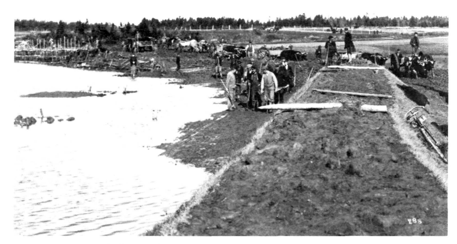
Figure Eight: Building a dyke at Long Island, Kings County, N.S.

work in producing "a framed group of photographs of the 16 mayors of the town since incorporation" for presentation to the town in 1928. The labour and patience entailed in his achievement were readily recognized: many of the finished pictures were enlargements of figures cut from old groups and re-photographed, but by all accounts Hardy executed this difficult job "to perfection".92